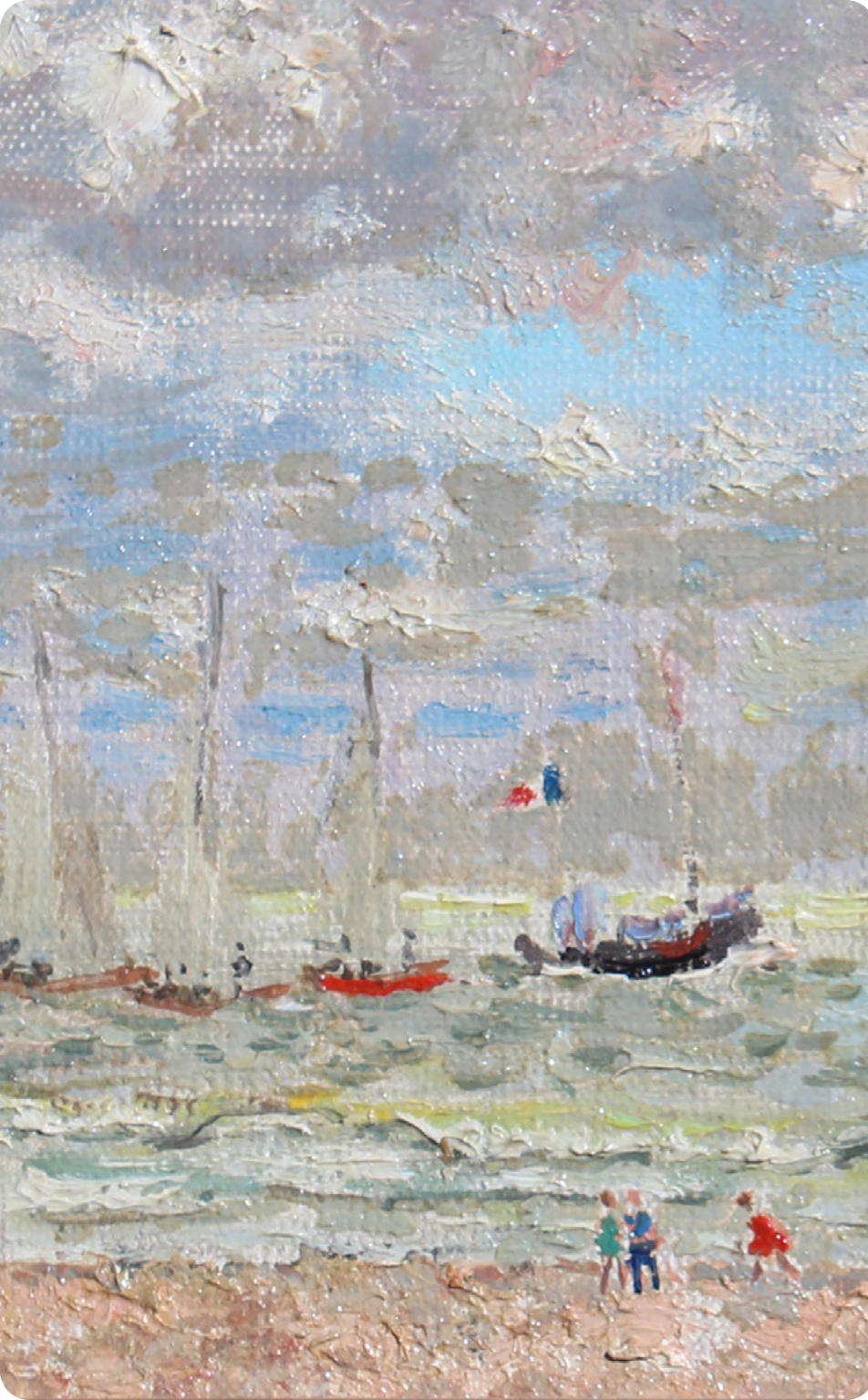
Vens les regates

oil on canvas 4 3/4 x 8 11/16 in. FG© 141752