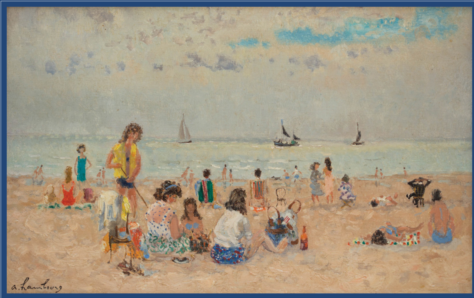
Temps Calme sur la Plage , 1960 oil on canvas | 8 11/16 x 13 3/4 in. | FG© 137293