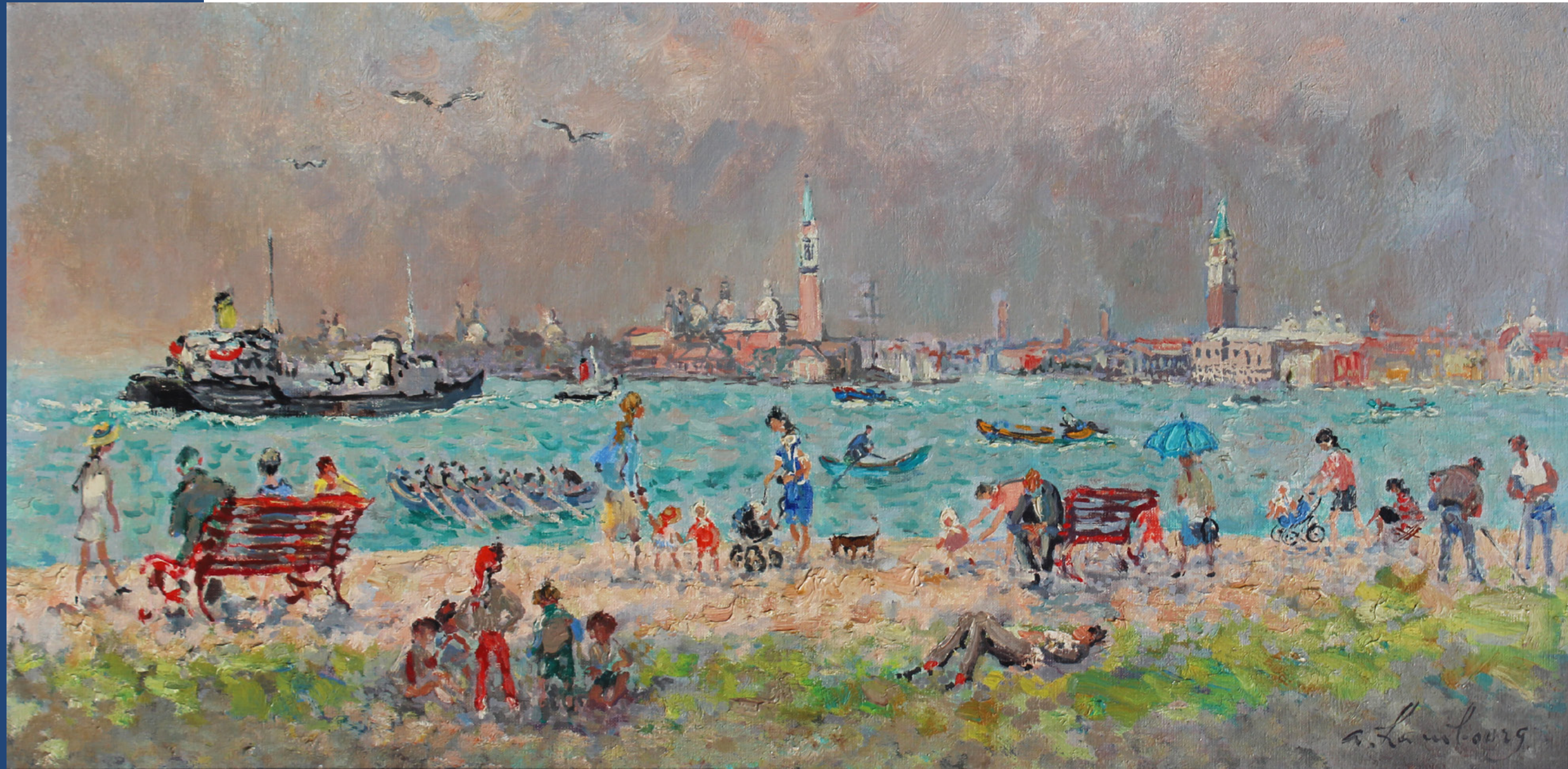
La promenade a Venise