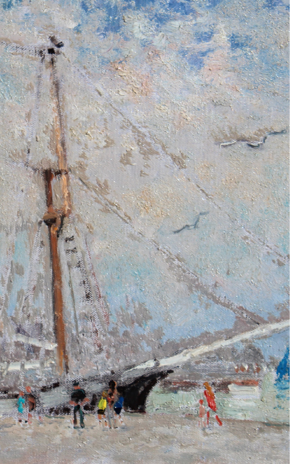
Le trois - mats en automne, 1968

oil on canvas 8 11/16 x 13 3/4 in. FG© 141750