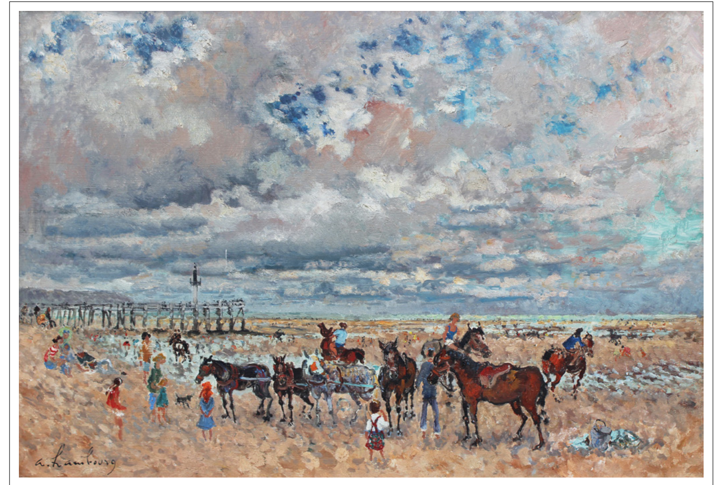
Les petits chevaux, maree basse, 1964 oil on canvas | 19 11/16 x 28 3/4 in. | FG© 140084