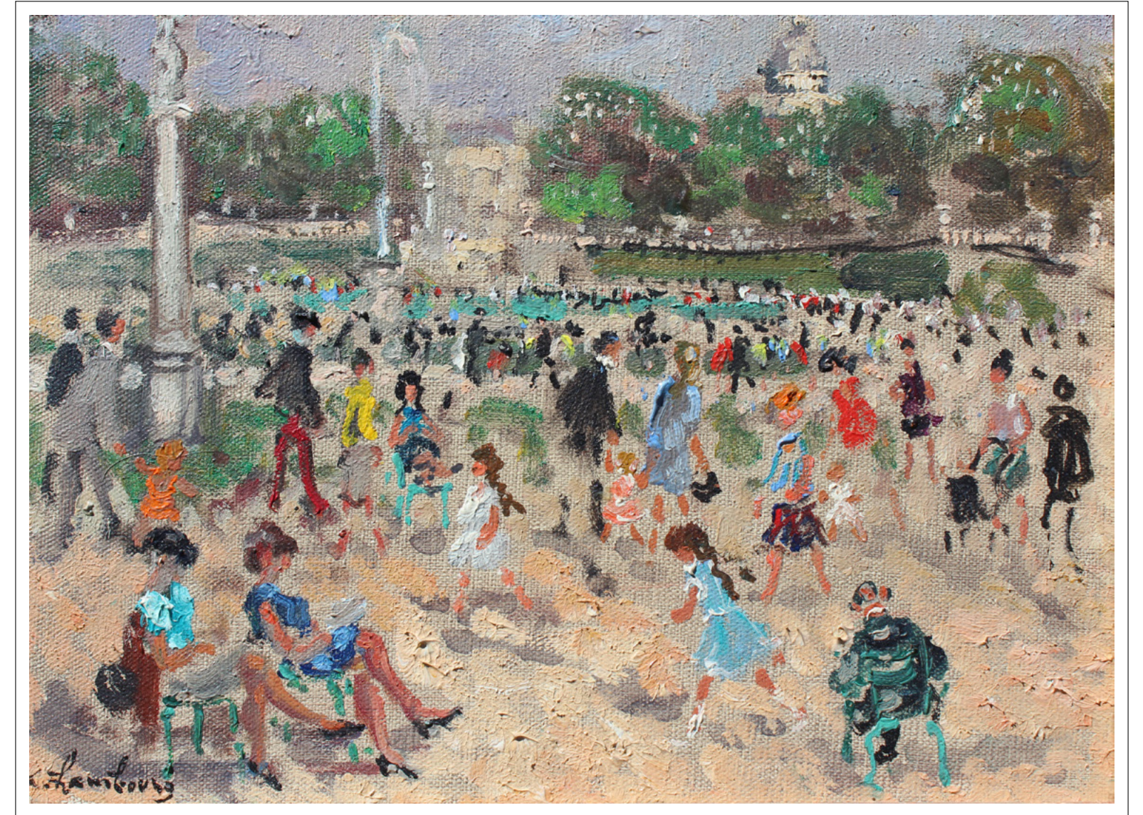
Jardin du Luxembourg oil on canvas | 6 5/16 x 8 11/16 in. | FG© 141735