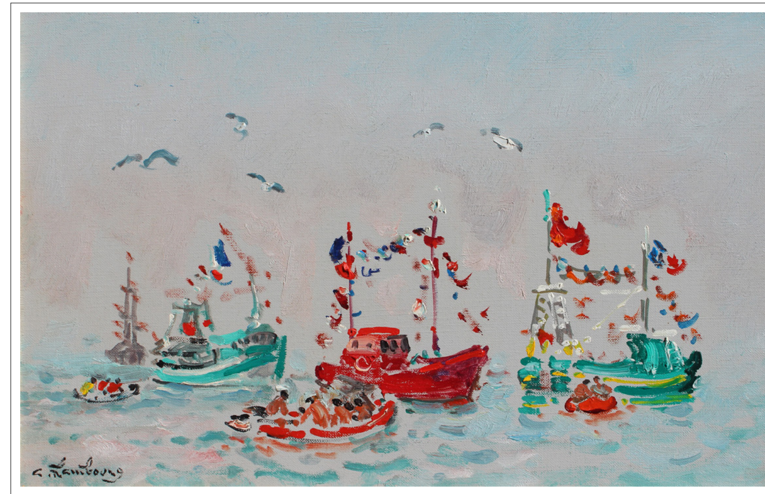
3 Chalutiers en fete, temps calme, 1988 oil on canvas | 8 11/16 x 13 3/4 in. | FG© 141751