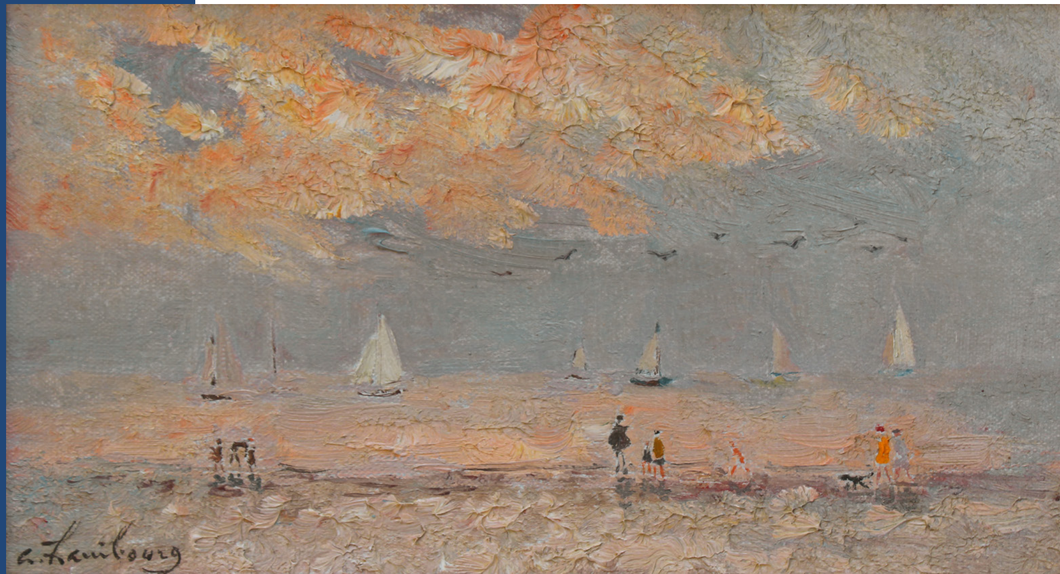
A maree haute, temps rose, 1971 oil on canvas | 4 3/4 x 8 11/16 in. | FG© 137414