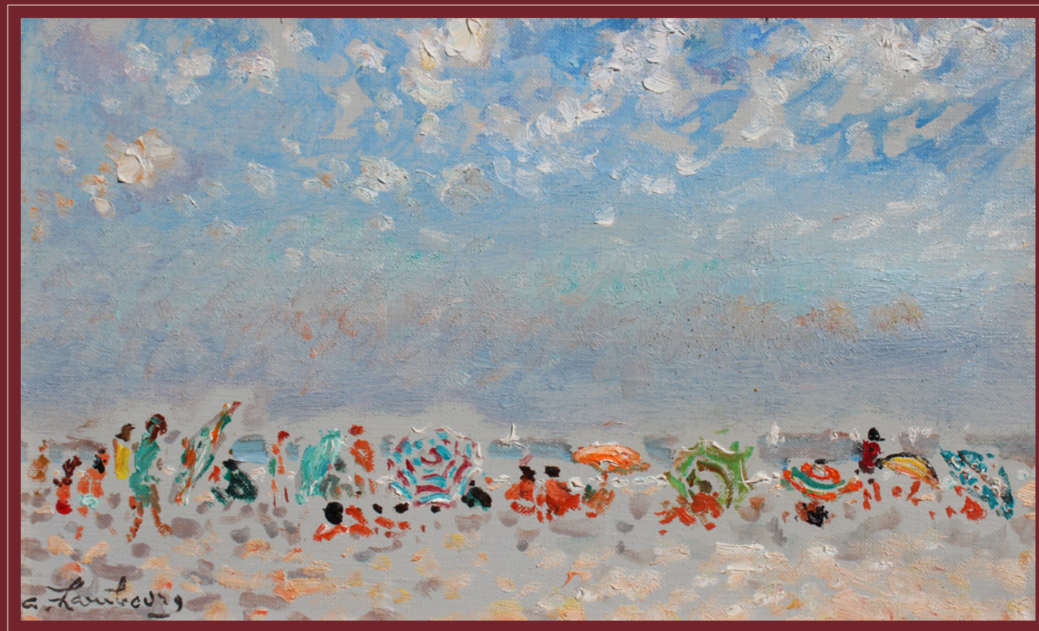
Les parasols par le beau temps, Deauville, 1993 oil on canvas | 6 5/16 x 10 5/8 in. | FG© 141810