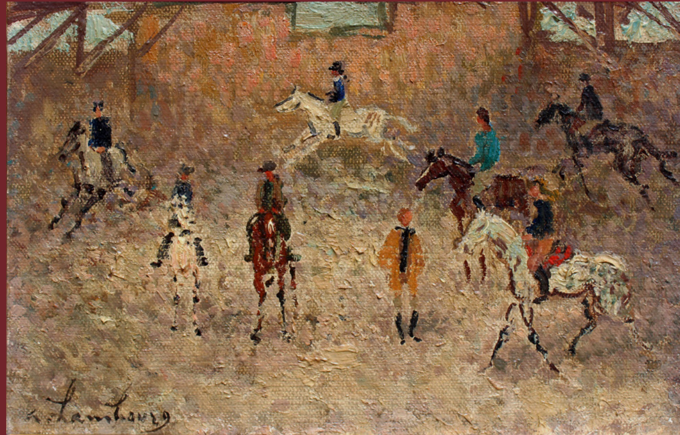
La Leçon au Menage, 1967 oil on canvas | 5 1/8 x 7 1/8 in. | FG© 141013