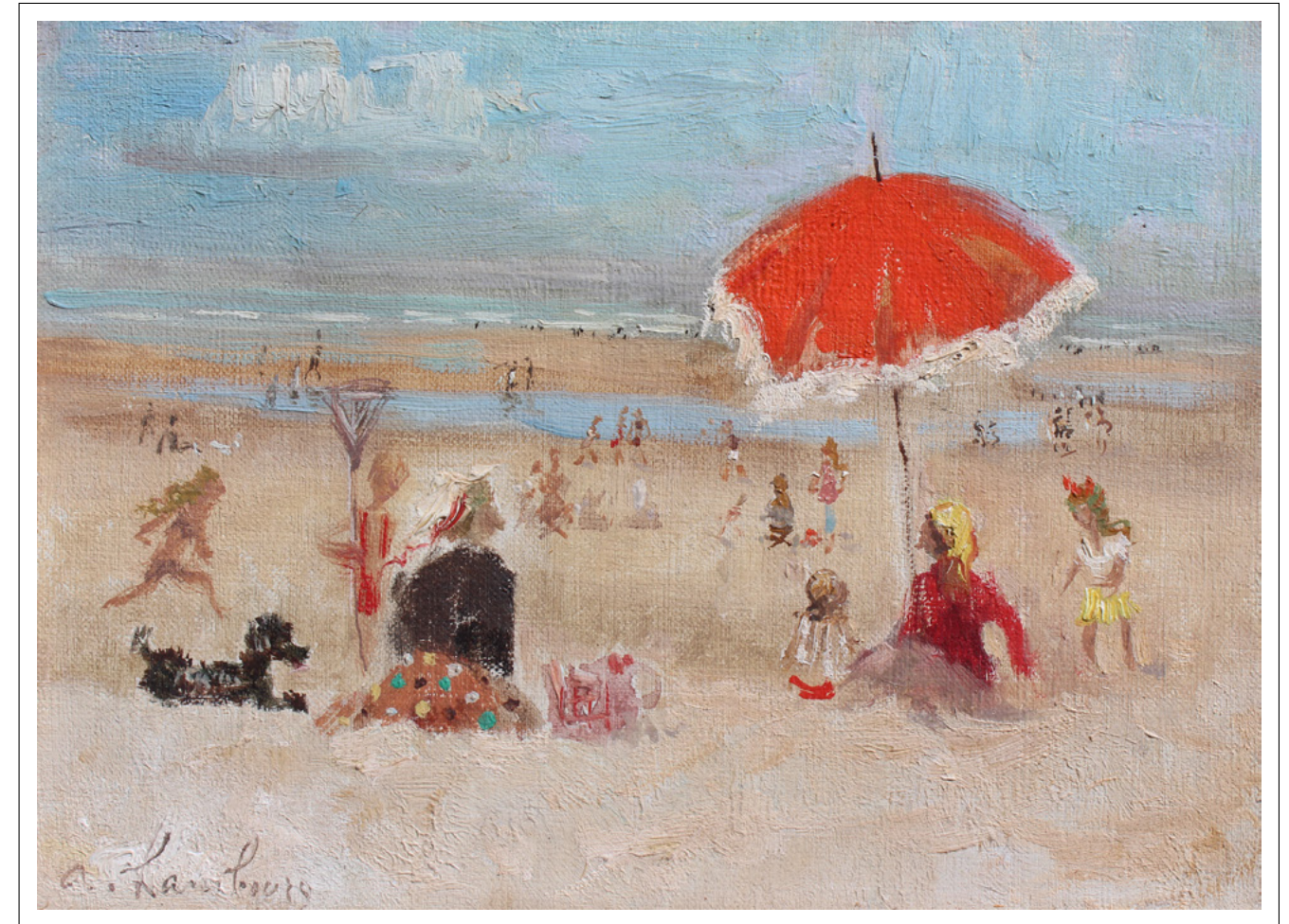
Le parasol rouge, Trouville , 1952 oil on canvas | 6 5/16 x 8 11/16 in. | FG© 141814