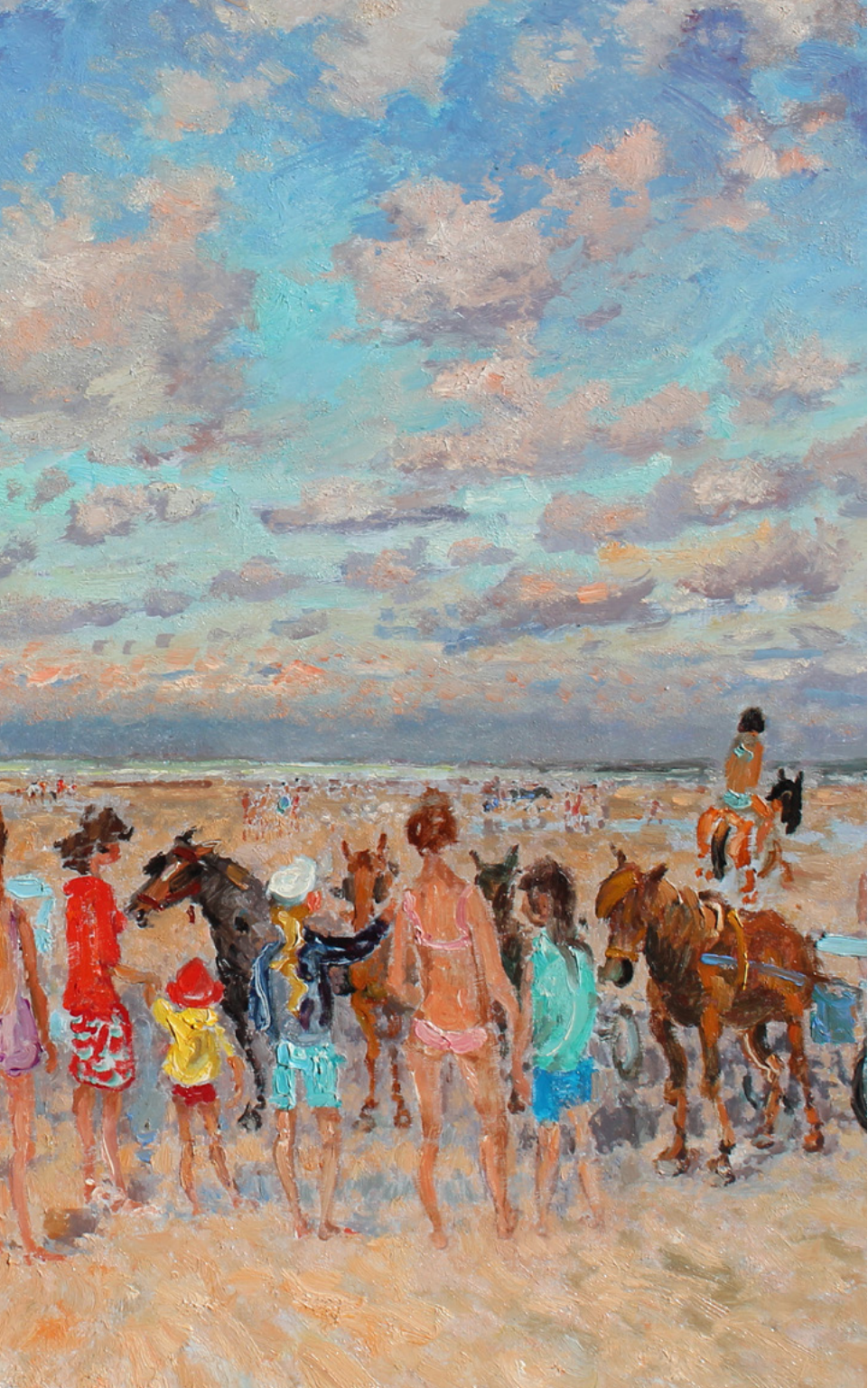
Beau temps sur la plage, a maree basse, Trouville, 1970

oil on canvas 31 7/8 x 39 3/8 in. FG© 141749