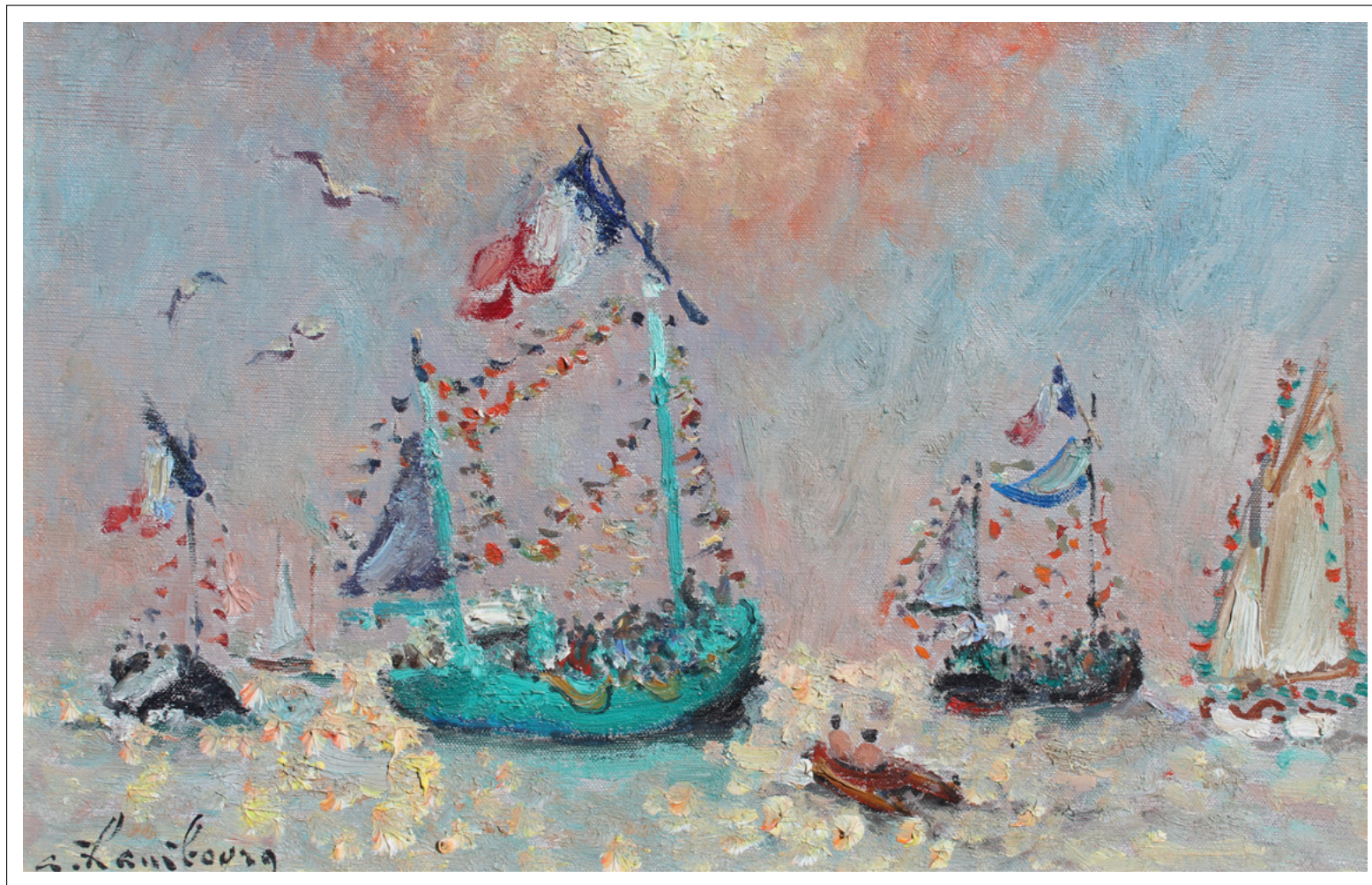
Les bateaux en fete, Trouville, 1974 oil on canvas | 8 11/16 x 13 3/4 in. | FG© 141811