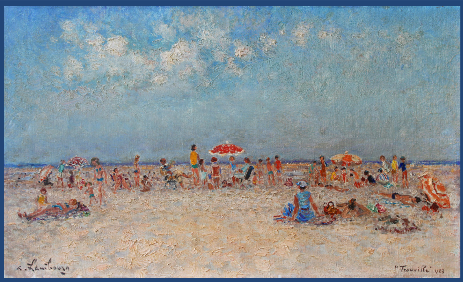
Beau temps sur la plage (Trouville en matin en Août), 1983 oil on canvas | 10 5/8 x 18 in. | FG© 137292