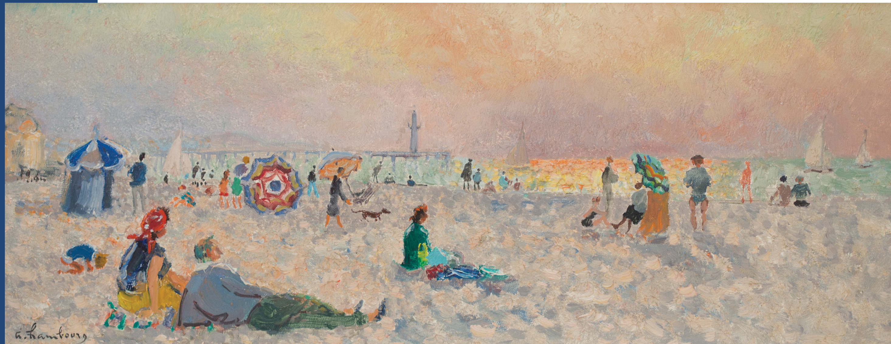
Fin de jour sur la plage, 1963

oil on canvas 7 7/8 x 19 5/8 in. FG© 138143