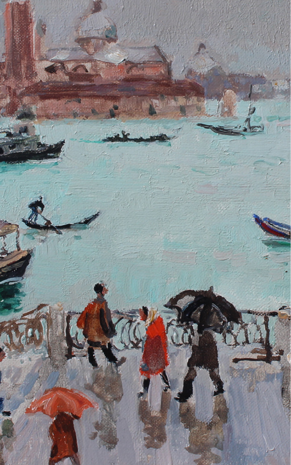
Place de Venise

oil on canvas 8 11/16 x 10 5/8 in. FG© 141198