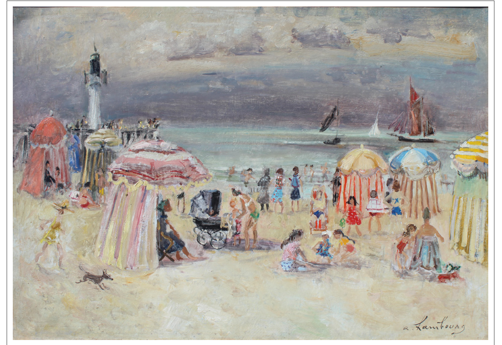
Le landau sur la plage oil on canvas | 19 11/16 x 28 3/4 in. | FG© 141200