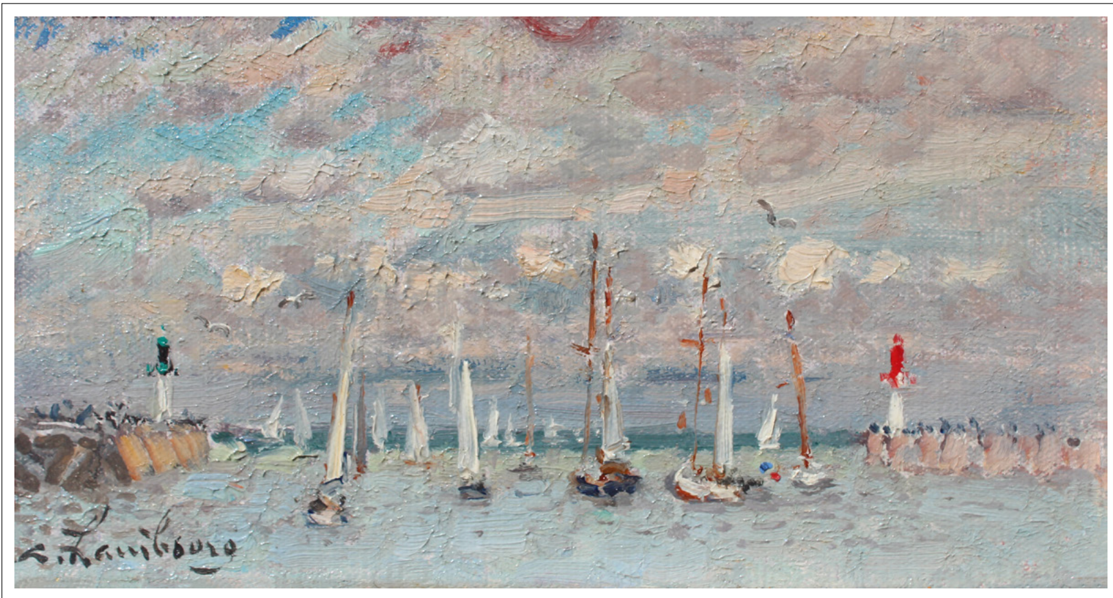
Voiliers sur la Touques oil on canvas | 3 15/16 x 7 1/16 in. | FG© 141472