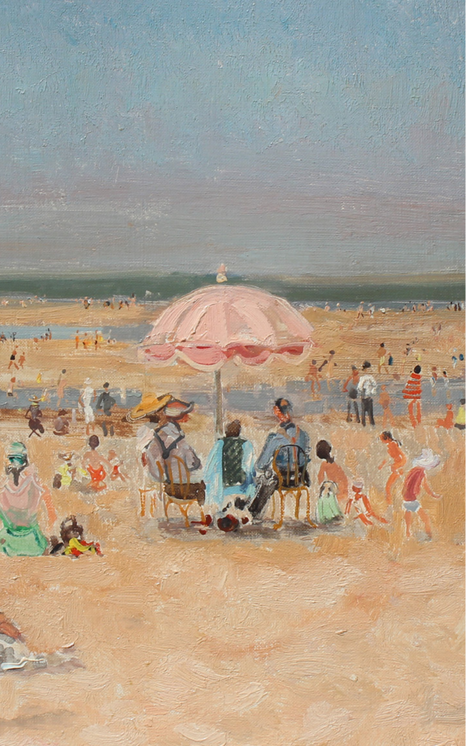
Maree Basse a Trouville, 1957

oil on canvas 14 15/16 x 21 5/8 in. FG© 141498