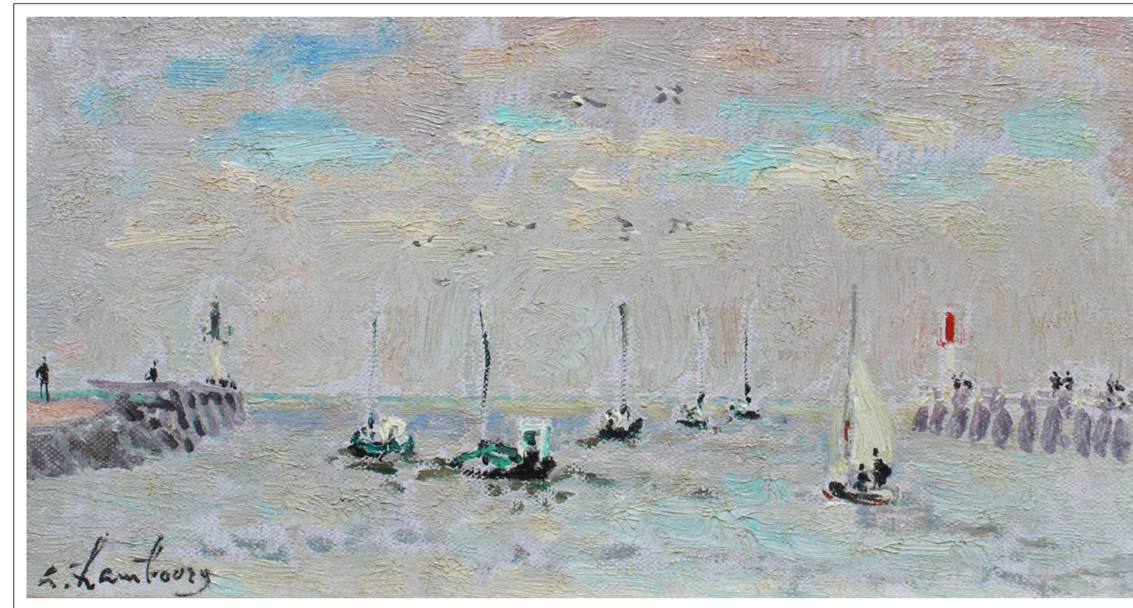
Temps Calme a Deauville, 1969 oil on canvas | 4 7/8 x 8 3/4 in. | FG© 140103