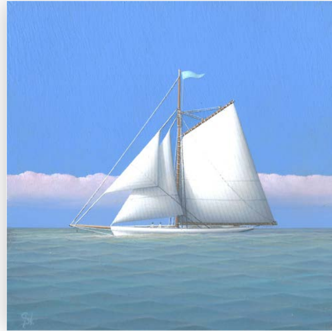
Glimmering Seas, 2023 | oil on canvas mounted on board 5 x 5 in. | FG© 141166