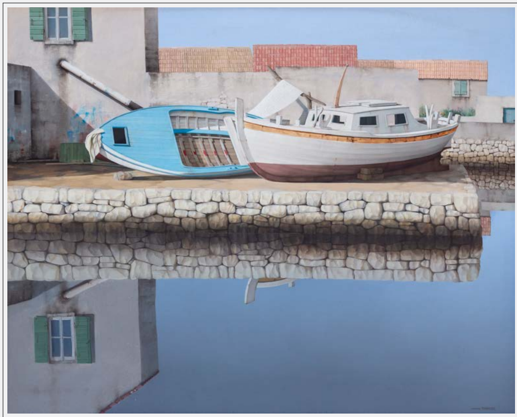
Zvonimir Mihanovic (b.1946) | The Repair Dock | oil on canvas | 39 3/8 x 31 7/8 in. | FG© 140071