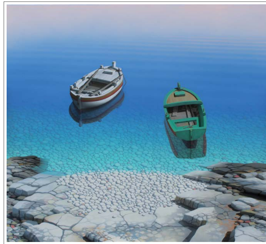
Zvonimir Mihanovic (b.1946) | Dawn's First Blush | oil on canvas | 41 x 45 1/4 in. | FG© 14169