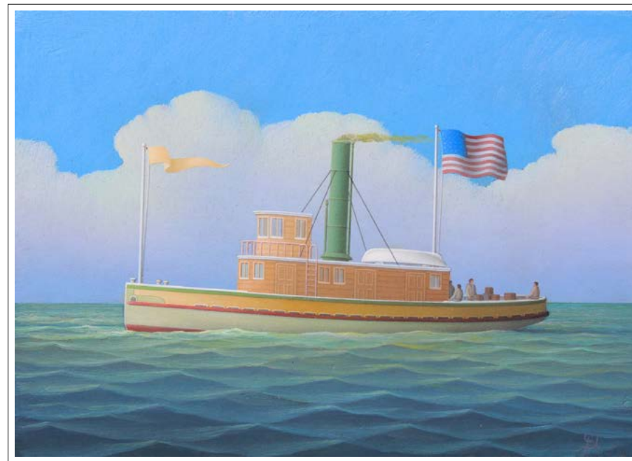
George Nemethy b.1952 | Wally I | oil on canvas board | 4 1/2 x 6 1/2 in. | FG© 138119