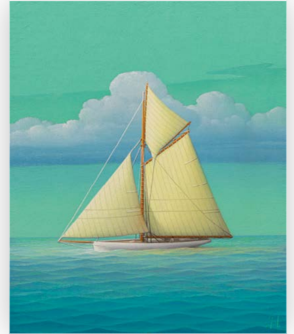
Marion to Bermuda | oil on canvas board 6 1/8 x 5 1/8 in. | FG© 139830