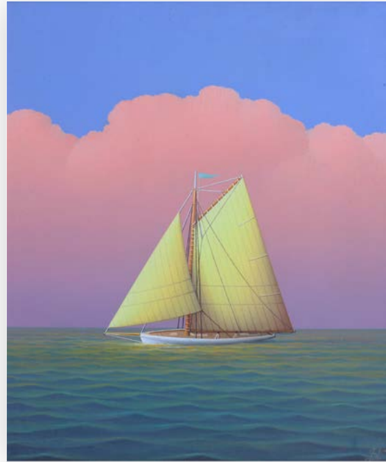
Happy Arrival | oil on canvas board 6 x 5 in. | FG© 141630

His paintings represent a marriage between a blissful state of mind and the highest level of craftsmanship and precision. His magic lies in creating an illusion with light, giving the sensation that the light is coming from the painting, not into it. Nemethy’s clouds are radiant, and his vessels include finely detailed rigs that he achieves using a two-haired brush. His paintings feel private and peaceful; they are a representation of the essence of tranquility.