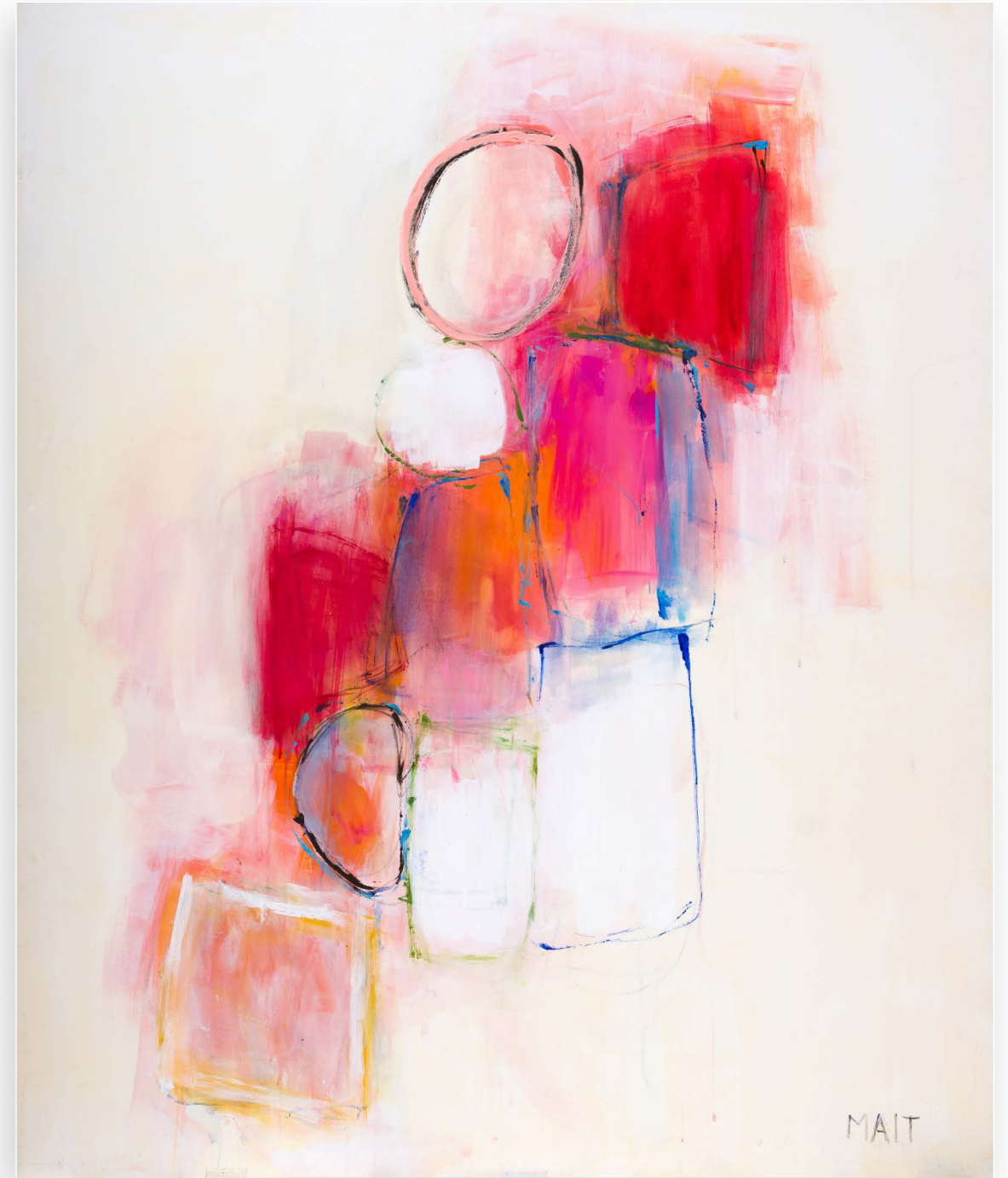
Raspberry | acrylic on canvas | 57 x 47 in. | FG© 141573