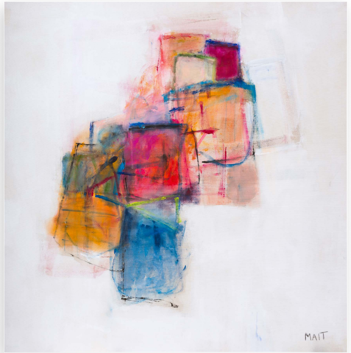
La La Land | acrylic on canvas | 48 x 47 in. | FG© 141563