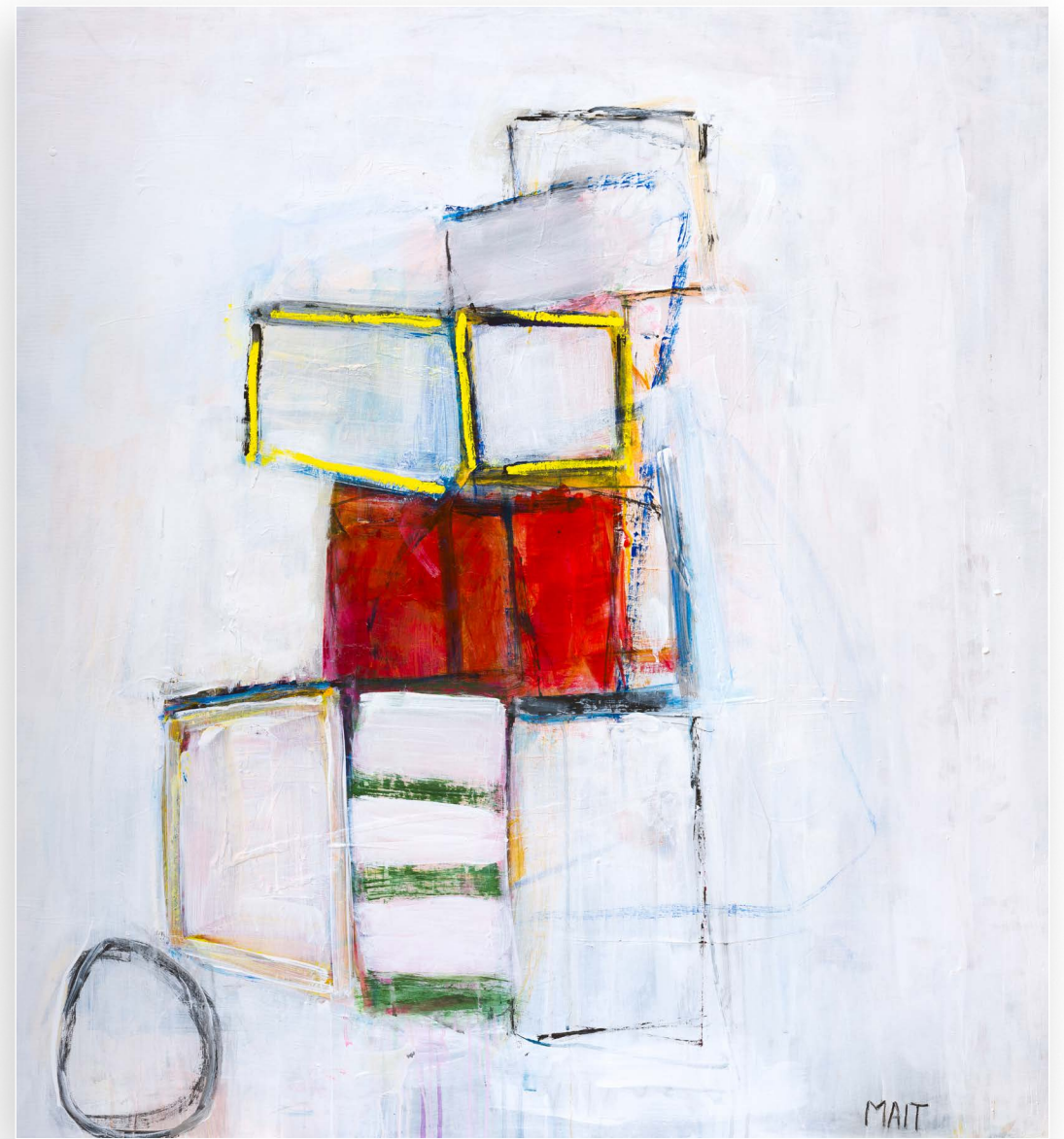
Empress | acrylic on canvas | 49 x 44 in. | FG© 141568