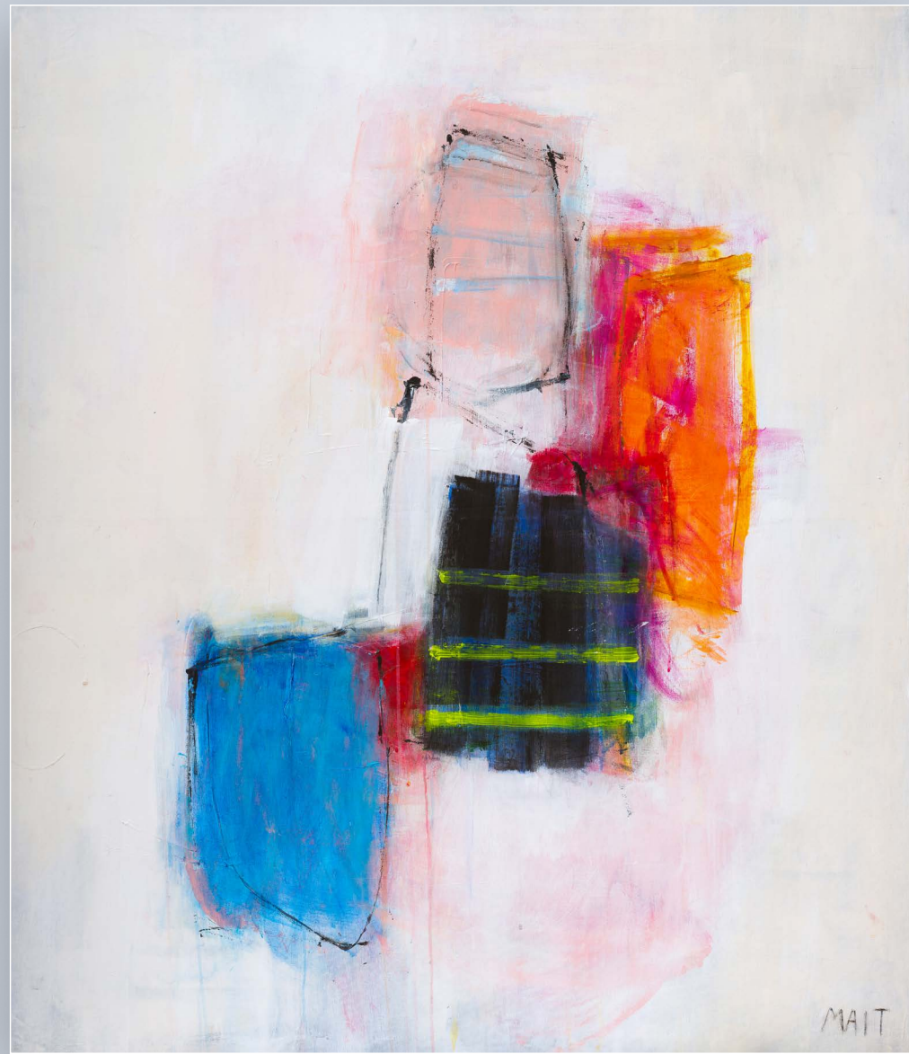
Bruised | acrylic on canvas | 51 x 44 in. | FG© 141559