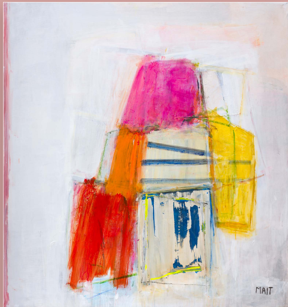
Sand Dunes | acrylic on canvas | 52 x 48 in. | FG© 141561