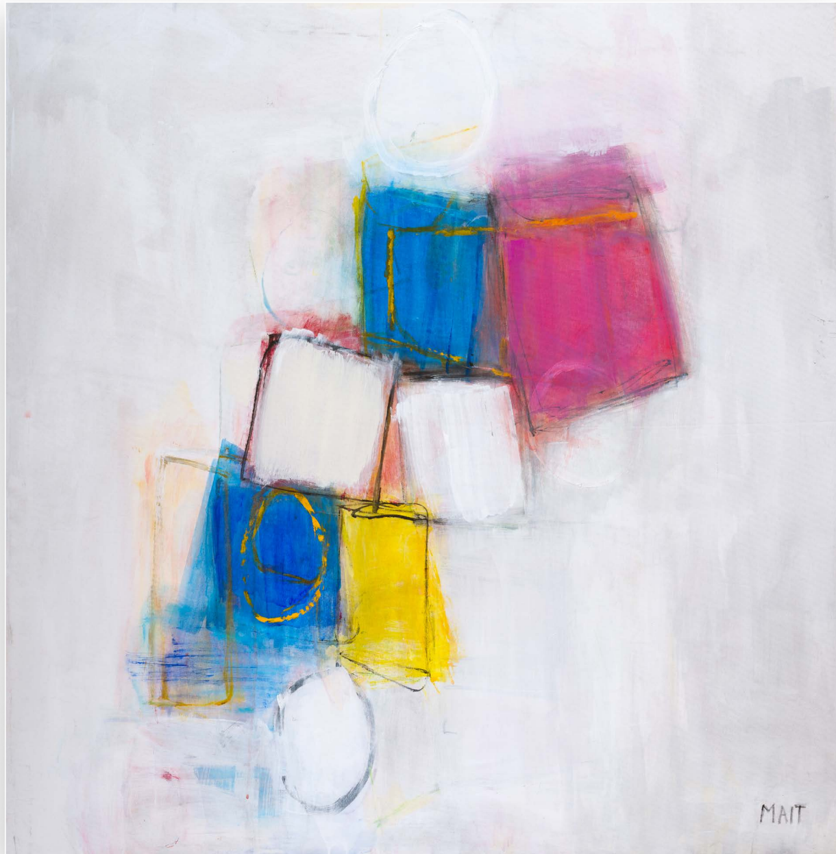
Jewels | acrylic on canvas | 48 x 47 in. | FG© 141571