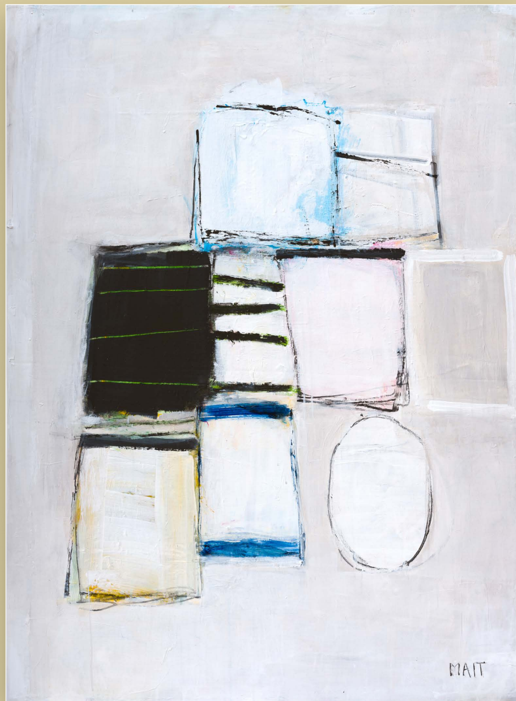
Gravity | acrylic on canvas | 53 x 40 in. | FG© 141564