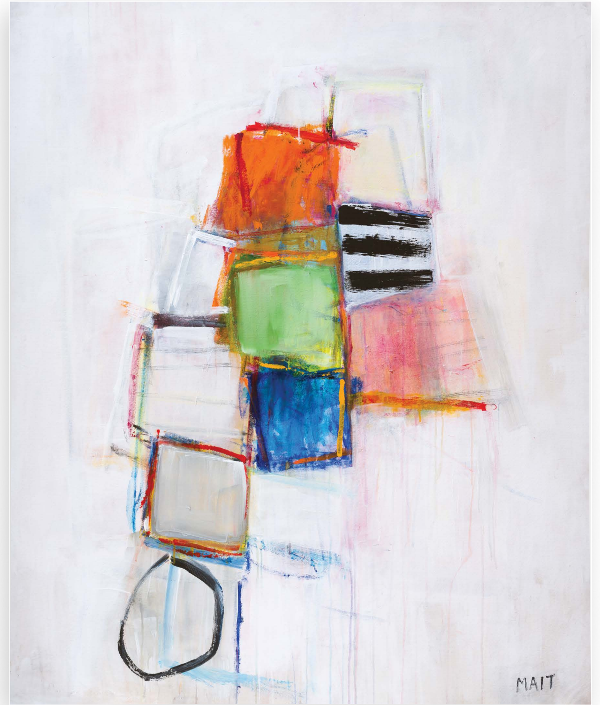
Jade | acrylic on canvas | 58 x 48 in. | FG© 141562