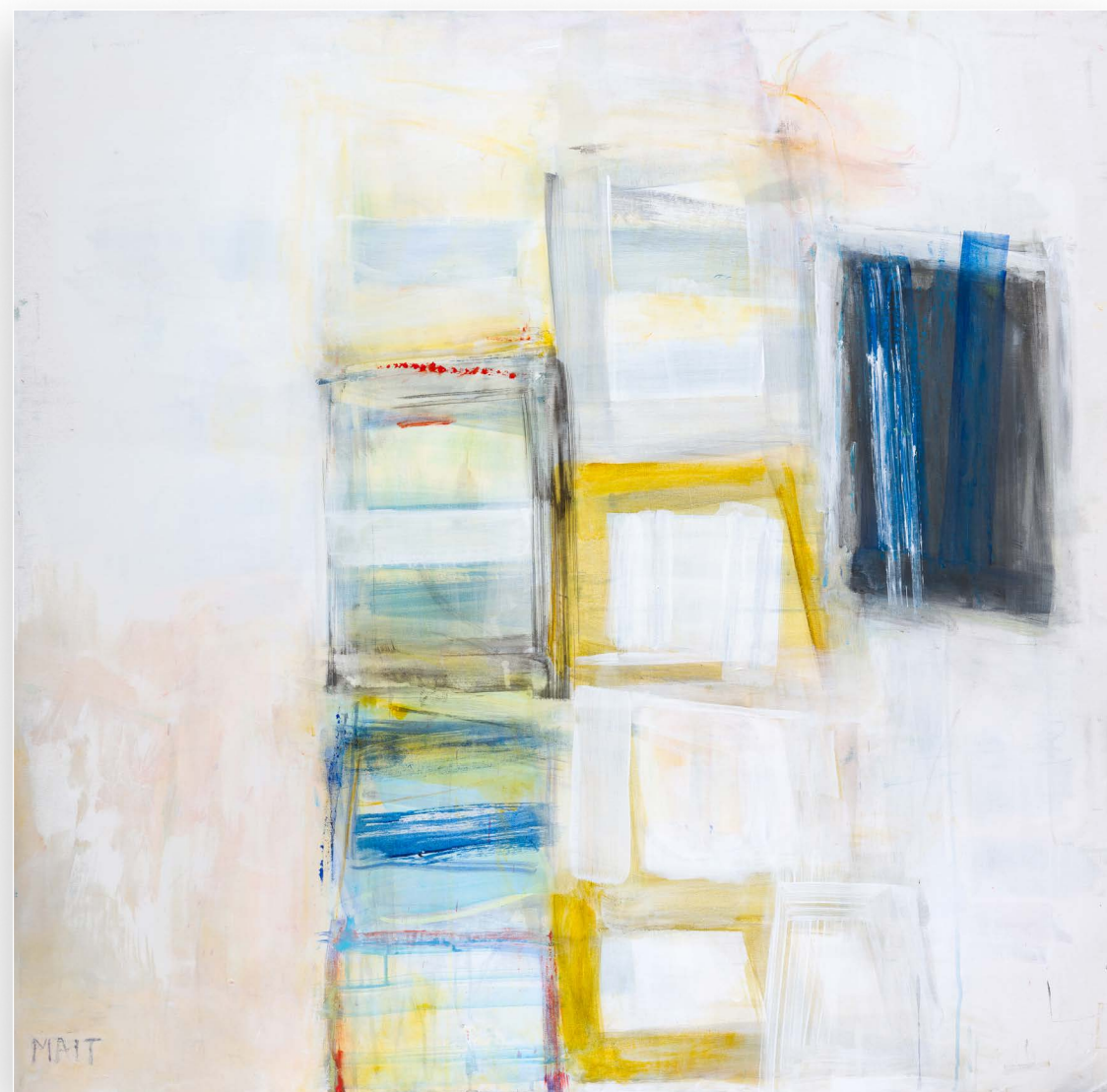
Khaki | acrylic on canvas | 47 x 48 in. | FG© 141570