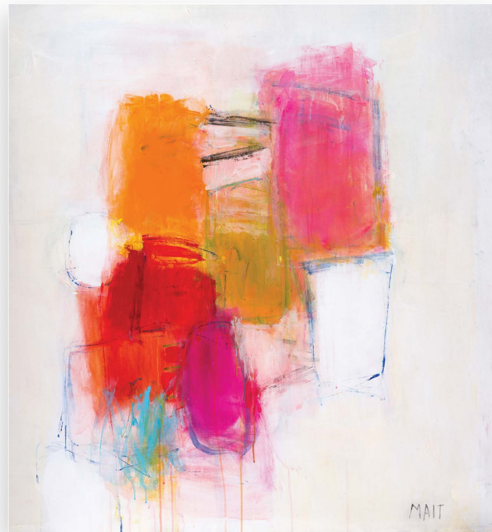
Salsa | acrylic on canvas | 46 x 43 in. | FG© 141566