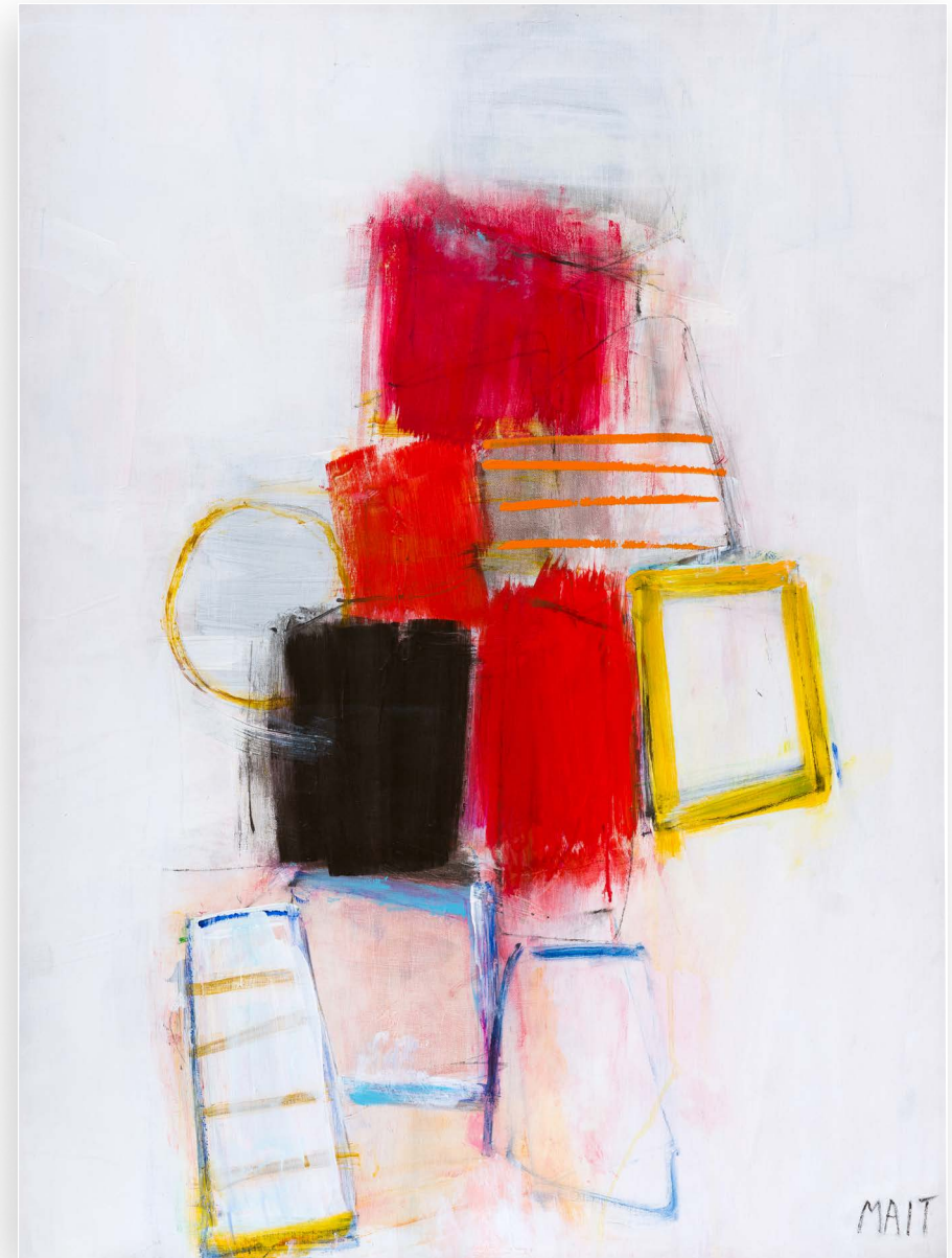
Siesta | acrylic on canvas | 38 x 28 in. | FG© 141560