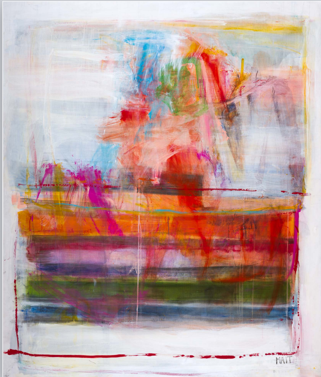
Breakout | acrylic on canvas | 55 x 47 in. | FG© 141572