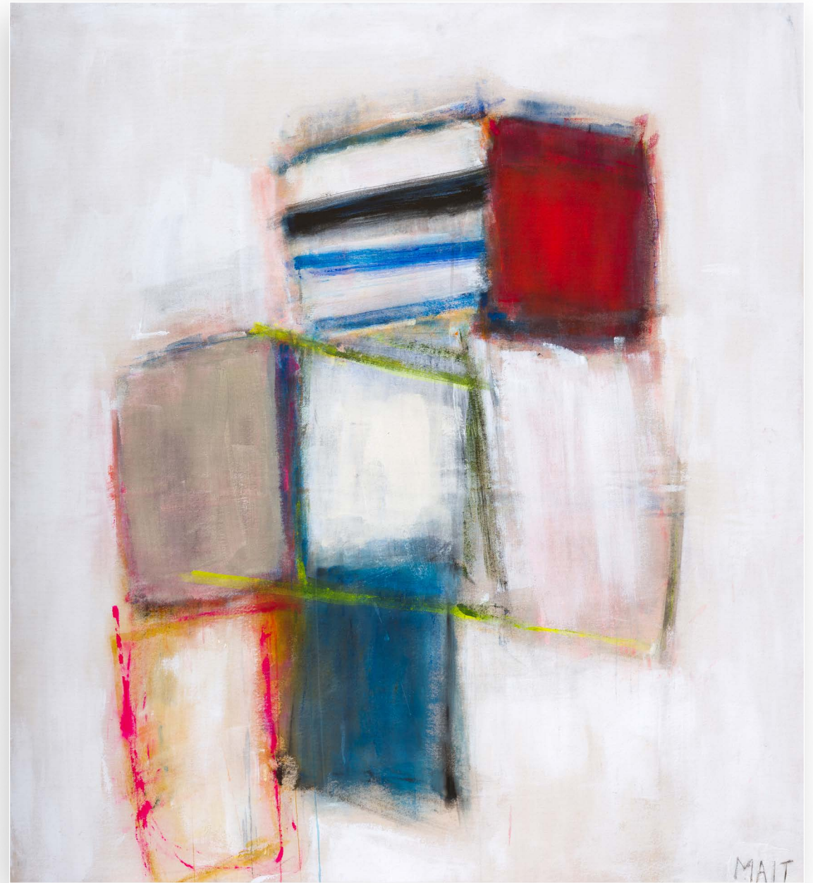
Ruby | acrylic on canvas | 53 x 48 in. | FG© 141565