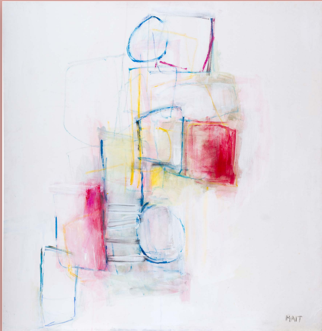
Jubilee | acrylic on canvas | 50 x 48 in. | FG© 141567