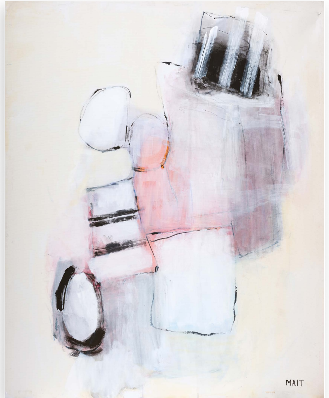
Fluff | acrylic on canvas | 60 x 48 in. | FG© 141569