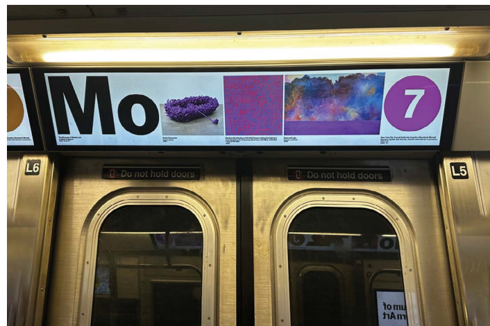
The Museum of Modern Art, New York recently featured Landfield's, Diamond Lake , 1969 in their 2024 Fall Subway Advertising Campaign.