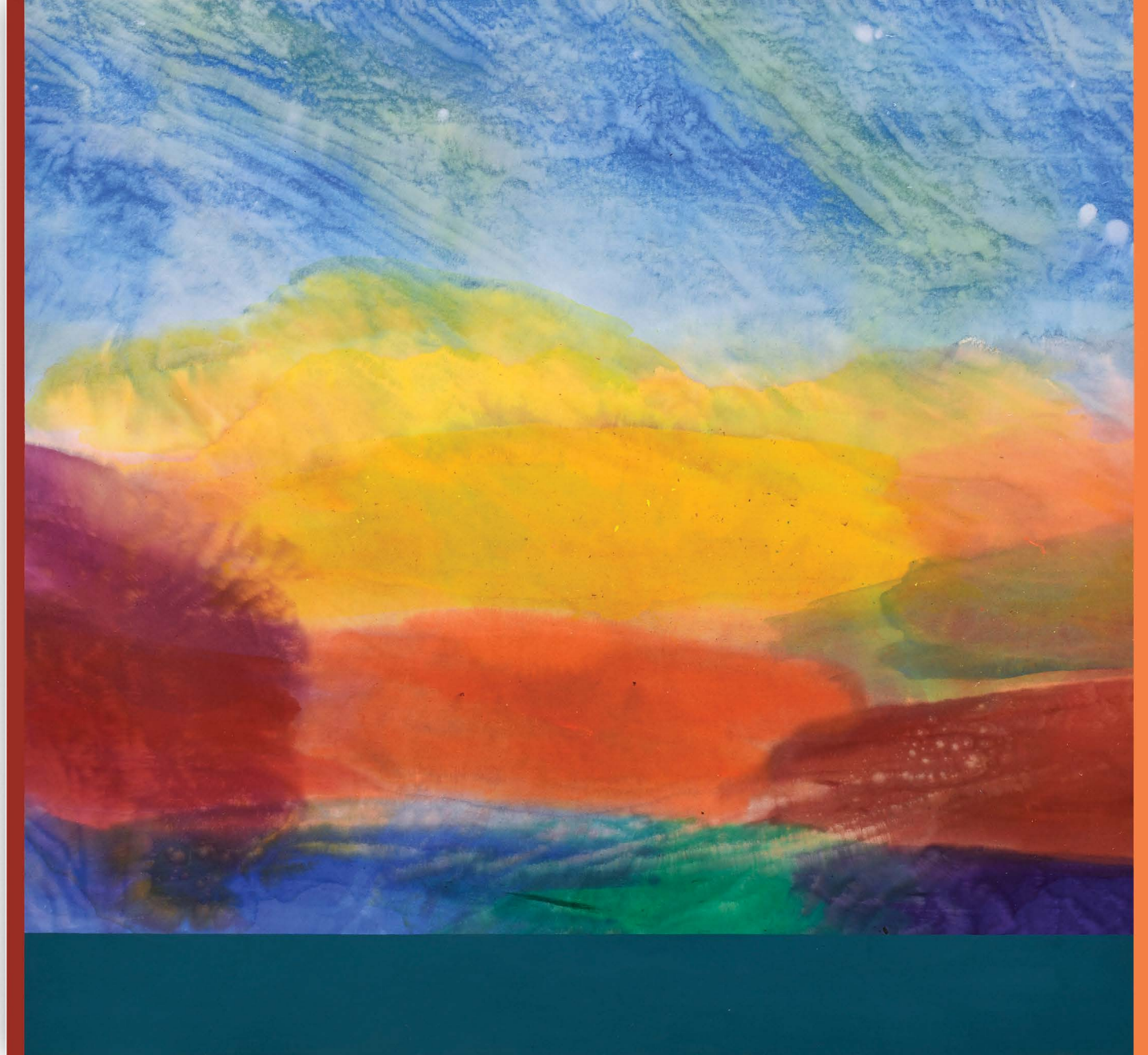
SUMMER PASSAGE | acrylic on canvas | 60 x 65 in. | FG© 141611