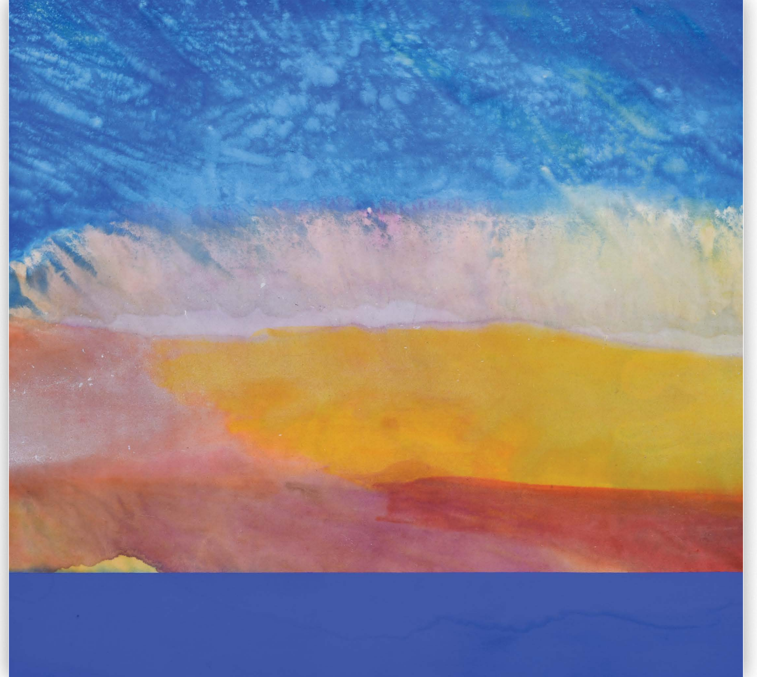
SONG IN TIME | oil on canvas | 50 1/2 x 56 in. | FG© 141612