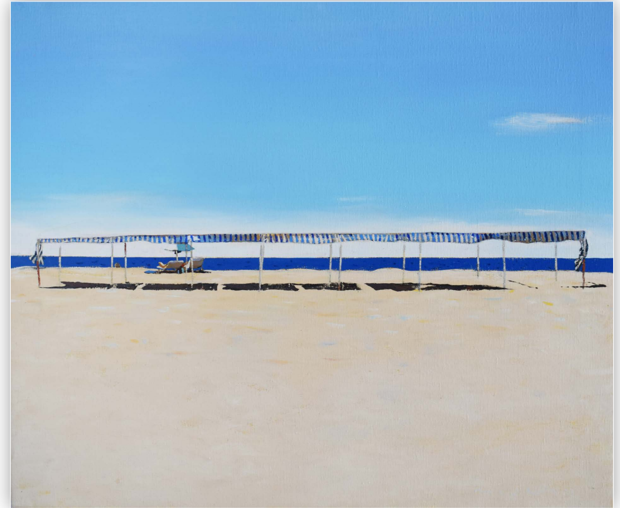
Magi Puig | Zona Blava | oil on canvas | 24 x 28 3/4 in. | FG©141227