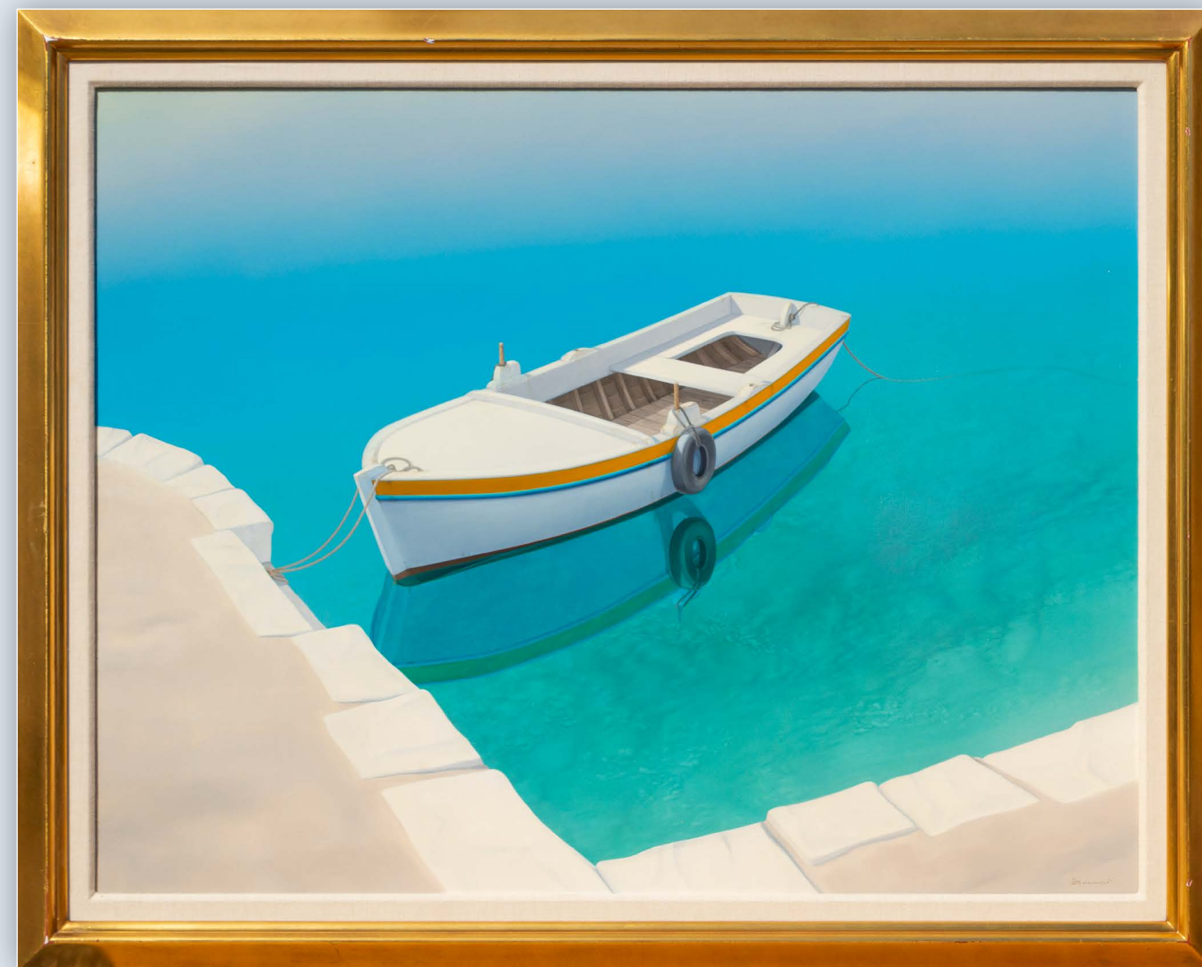
Rinaldo Skalamera | Natures Mirror oil on canvas | 33 1/8 x 42 3/4 in. | FG©130808