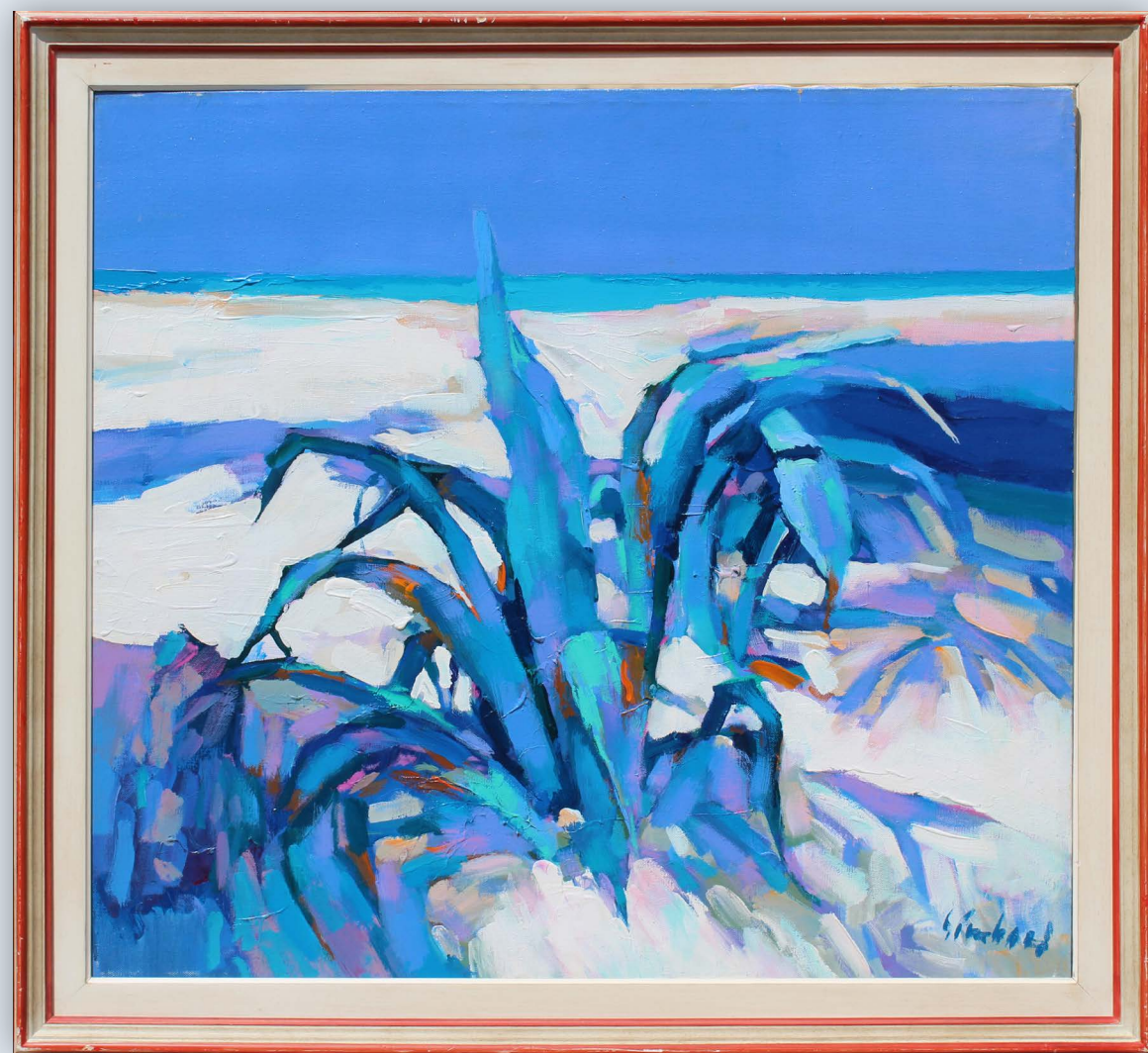
Nicola Simbari (1927-2012) | Peruvian Beach acrylic on canvas | 35 1/2 x 39 1/2 in. | FG©107707