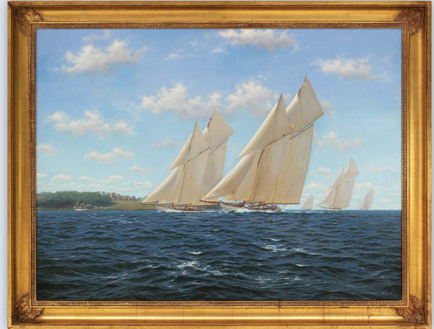
Stephen J. Renard | Westward slightly leading Cicely off Norris Castle in the Solent. , 1992 oil on canvas | 29 7/8 x 39 3/4 in. | FG©134632