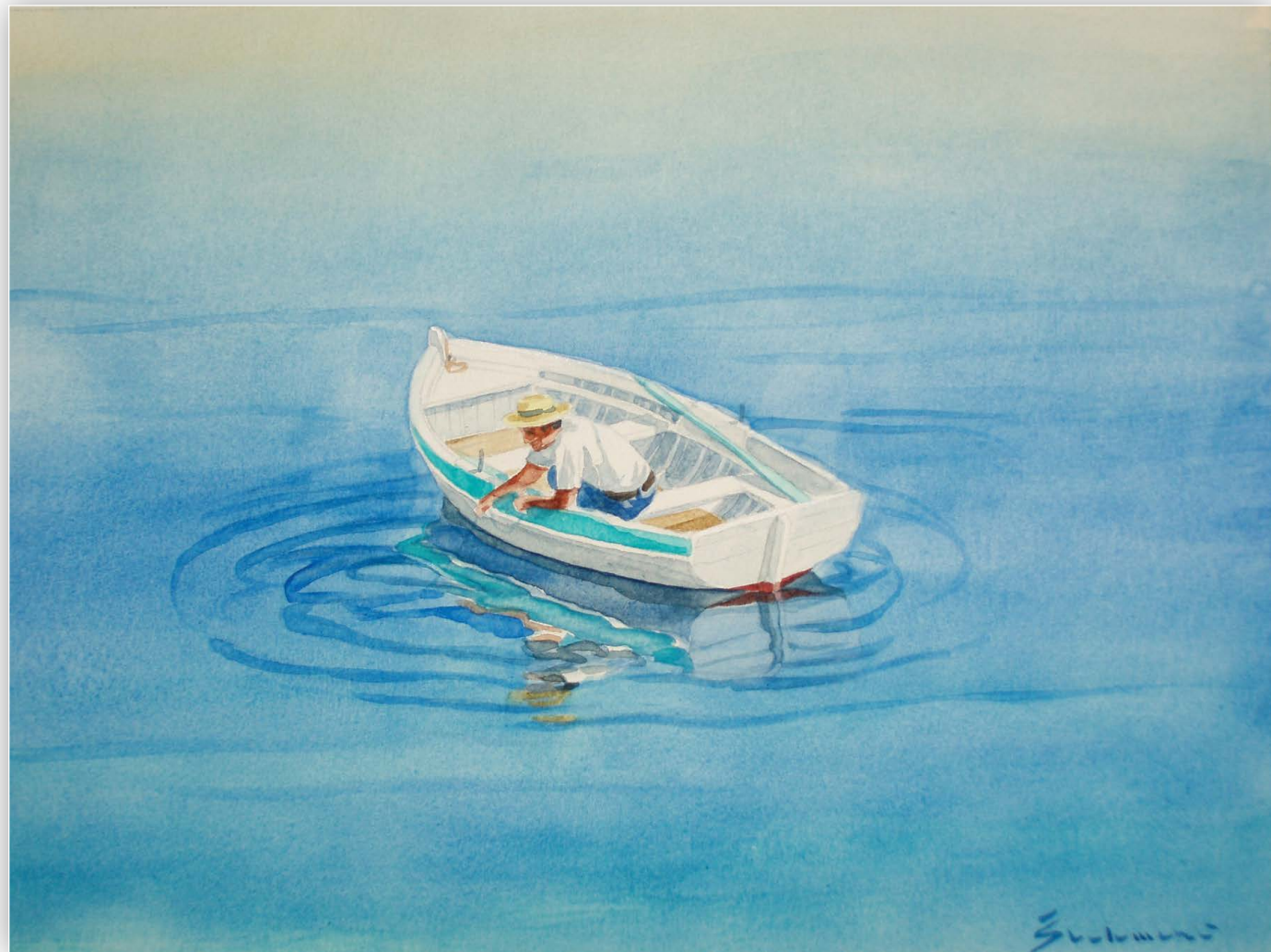
Rinaldo Skalamera | Healing Waters watercolor paper | 7 5/8 x 10 1/4 in. | FG©131750