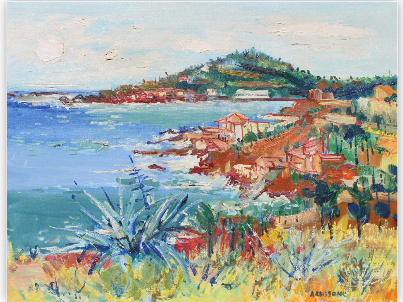
Yolande Ardissonne | Les Calanques d'Antheor oil on canvas | 25 9/16 x 31 7/8 in. | FG©139738