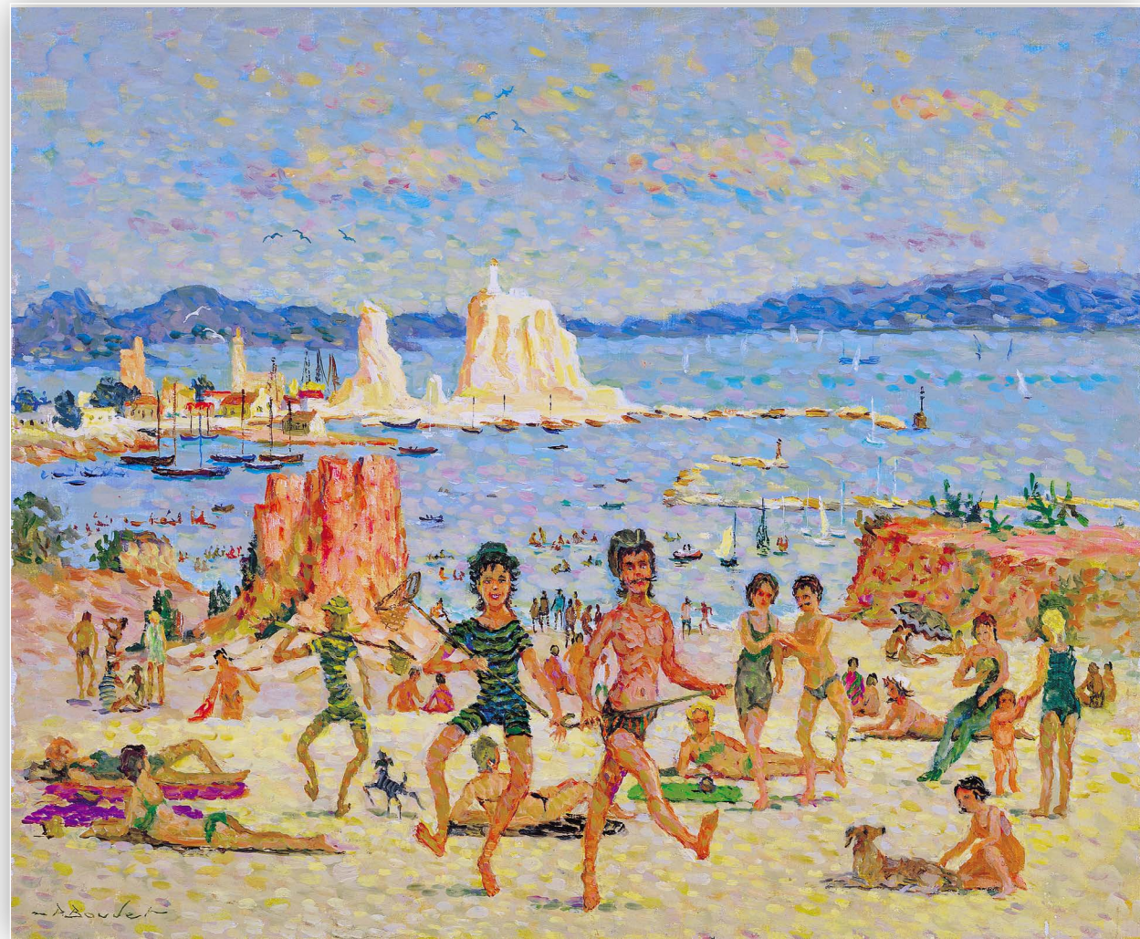
Pierre Boudet | Place de La Mede | oil on canvas | 21 1/4 x 25 9/16 in. | FG©120787