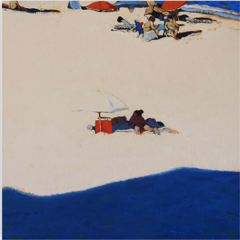
Magi Puig | Bandera | oil on canvas | 18 x 18 in. | FG©141281