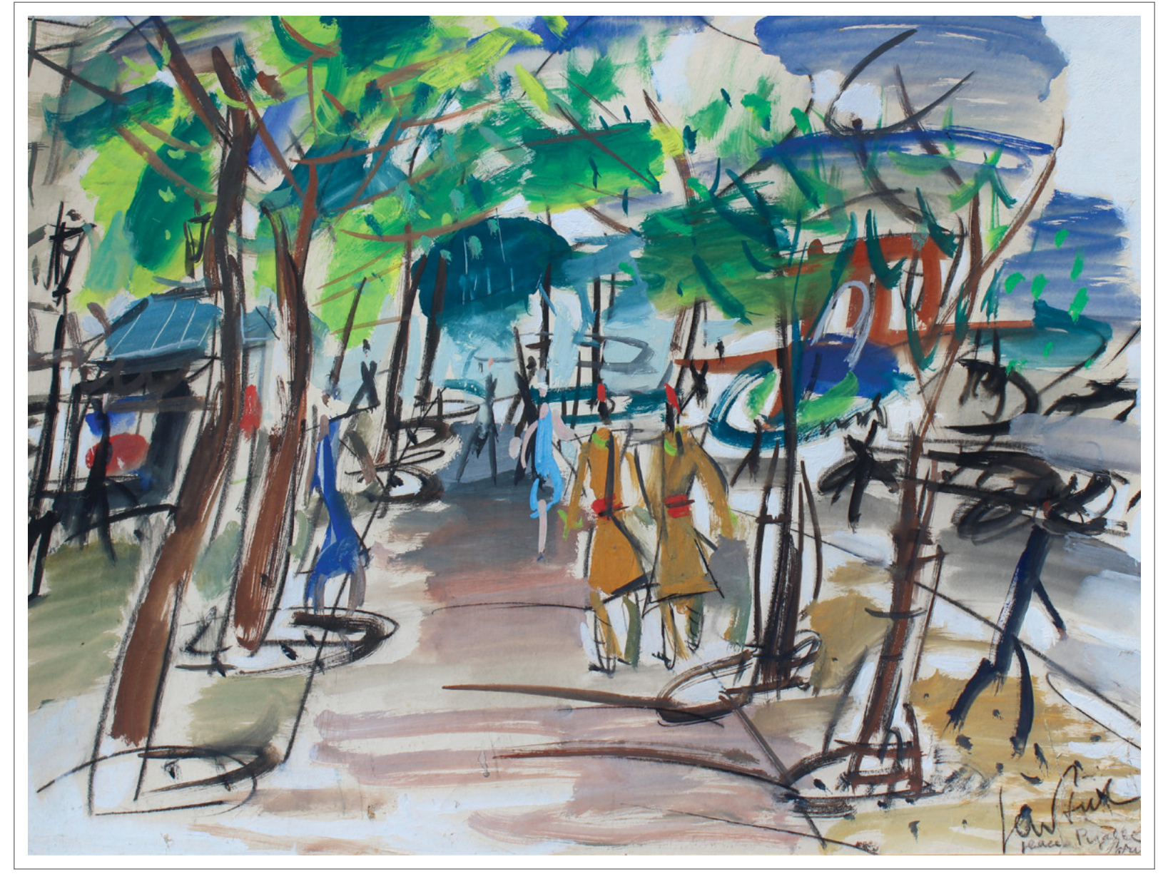
Paris, Place Pigalle | gouache and pencil on paper | 18 3/4 x 25 in. | FG© 140077