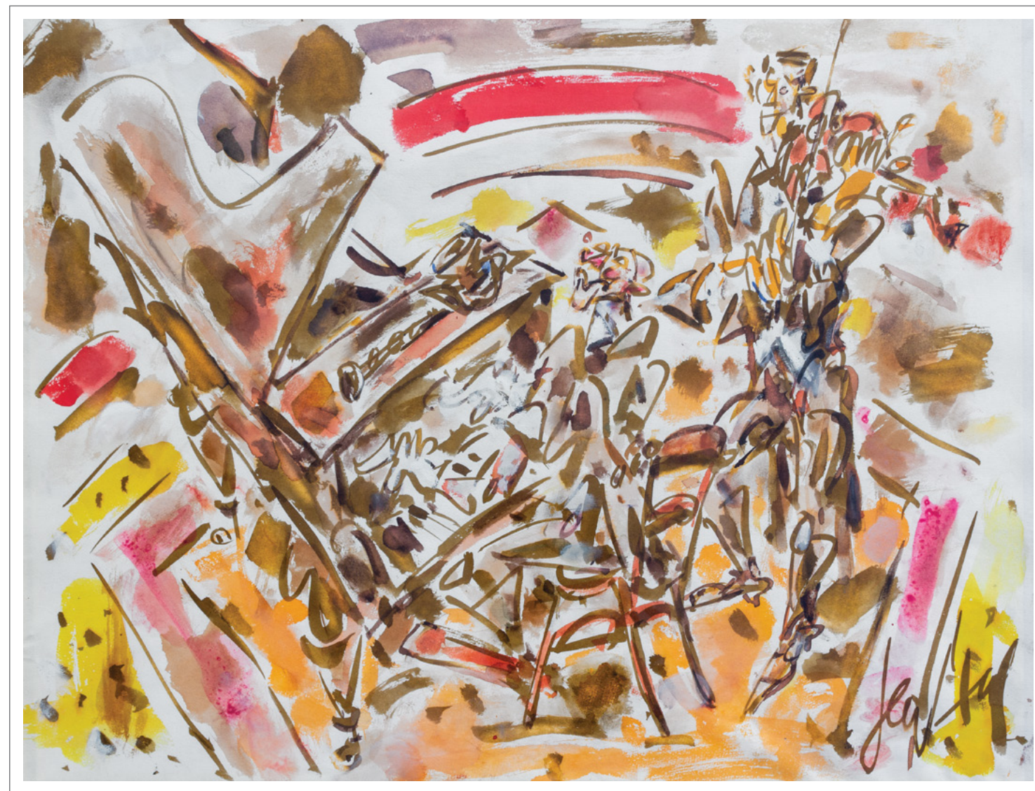
Pianiste et Violoniste | watercolor on paper | 18 7/8 x 24 3/4 in. | FG© 136545

Centre Pompidou, Paris Les Abbatoirs Musée-FRAC Occitanie Toulouse, France Musée d'art moderne de la Ville de Paris Musée de Montmartre, Paris