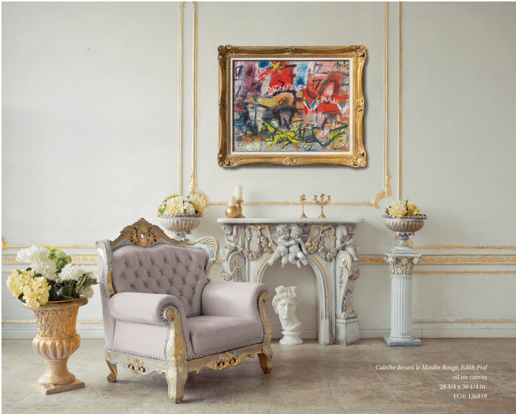
Caleche devant le Moulin Rouge, Edith Piaf oil on canvas 28 3/4 x 36 1/4 in. FG© 136819