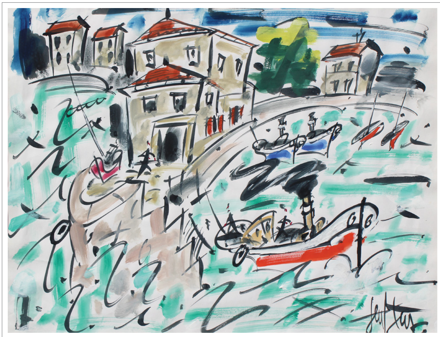
Le port de Saint-Jean-de-Luz | gouache on paper | 19 3/4 x 25 5/8 in. | FG© 140118