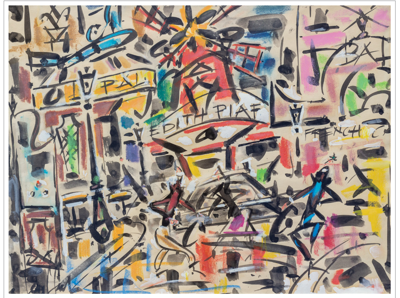
(cover) Edith Piaf au Moulin Rouge | gouache on paper | 19 11/16 x 25 9/16 in. | FG© 135931