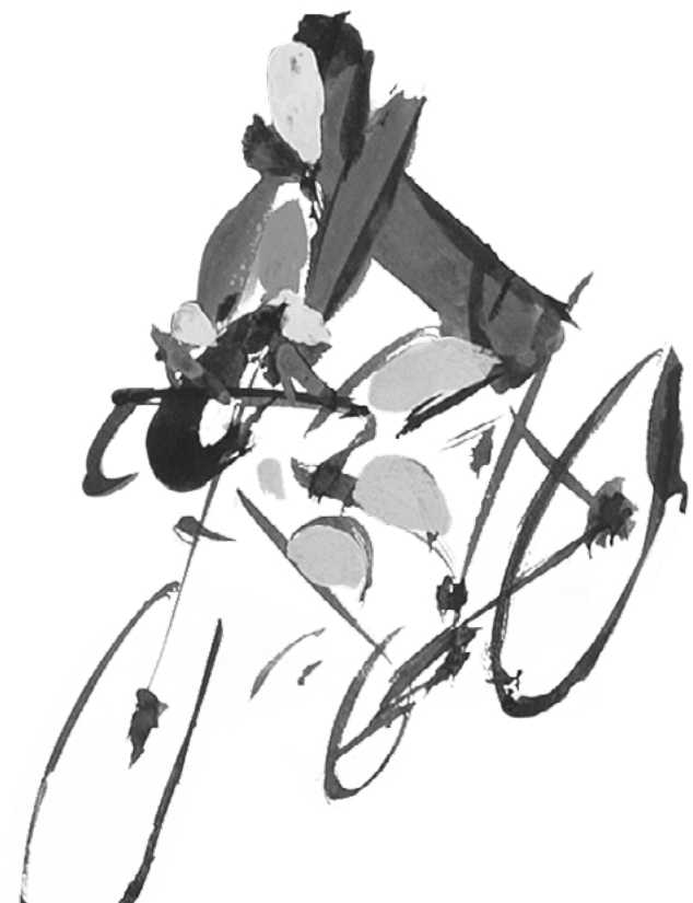
rue Parisienne watercolor & gouache on paper 19 5/8 x 25 5/8 in. FG© 135688