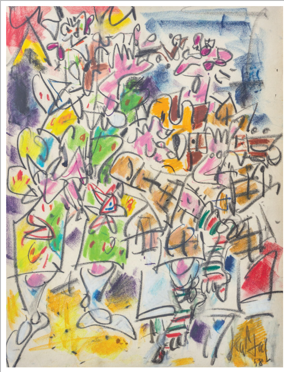
(left) Clowns musiciens, 1958 pastel on paper 16 1/8 x 12 9/16 in. FG© 137076