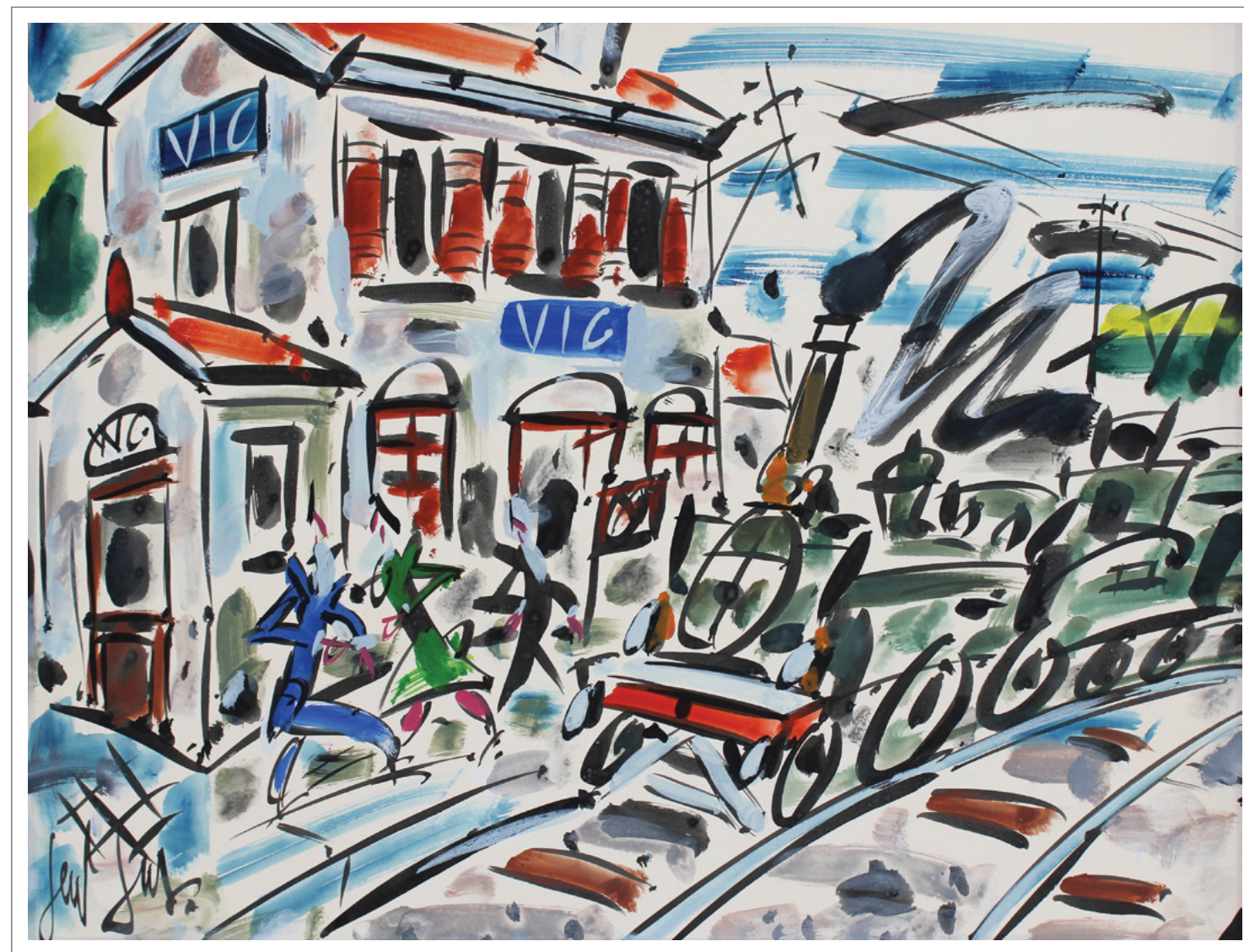
La gare de Vic, 1970 | gouache on paper | 19 3/4 x 25 1/2 in. | FG© 139997