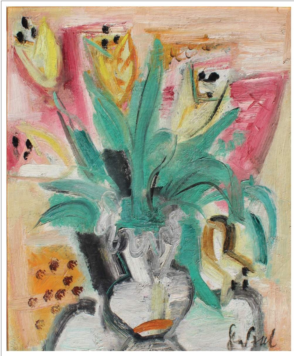
Bouquet de fleur de lis jaune oil on canvas 21 5/8 x 18 1/8 in. FG© 138530