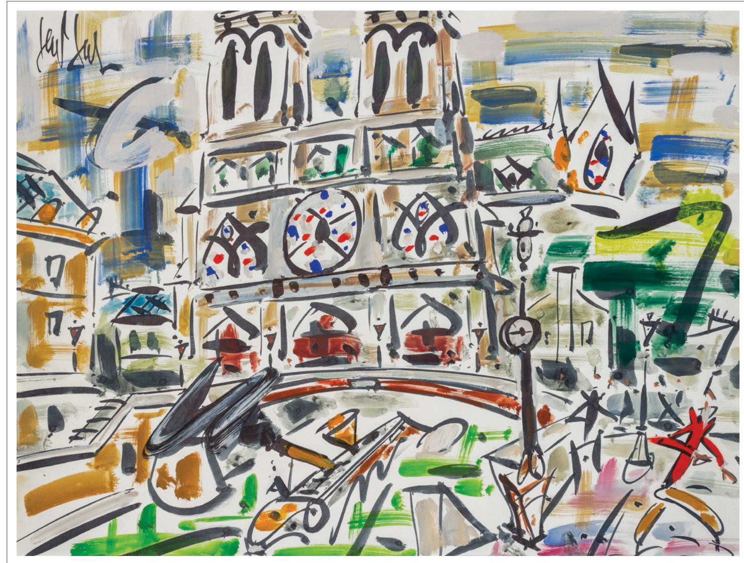
Notre-Dame de Paris | gouache on paper | 19 x 24 7/8 in. | FG© 140834