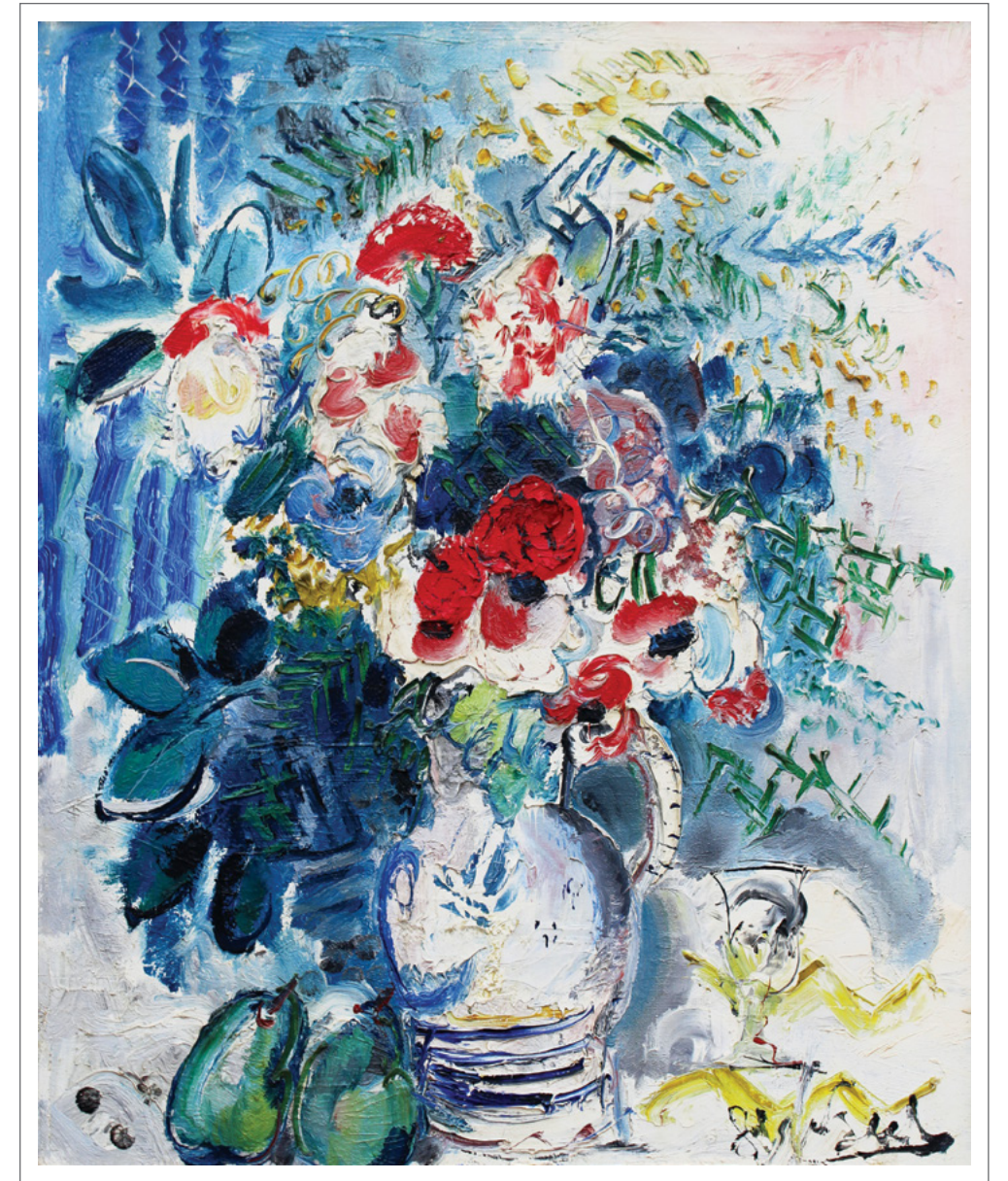
Nature morte avec fleurs oil on canvas 28 3/4 x 23 1/2 in. FG© 139764