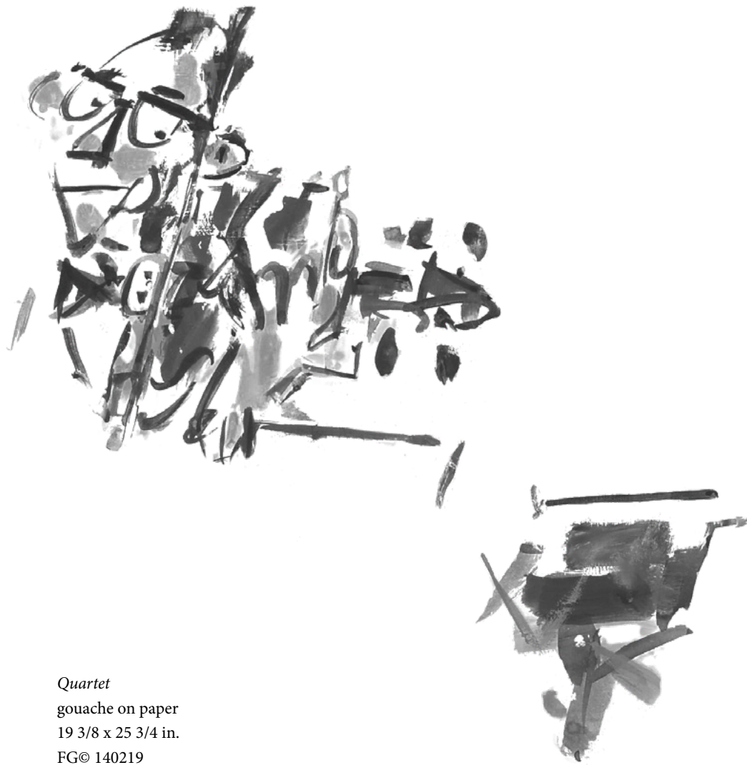
Quartet gouache on paper 19 3/8 x 25 3/4 in. FG© 140219