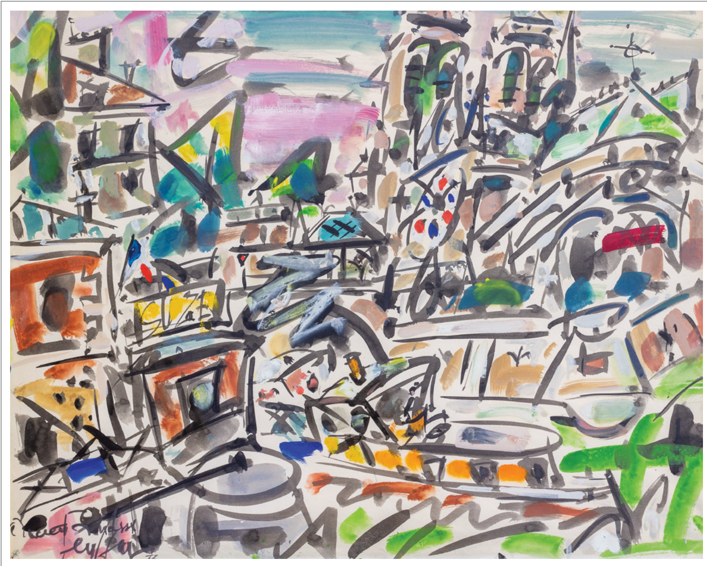
Le chevet de Notre Dame , 1973 | gouache on paper | 19 1/4 x 24 3/4 in. | FG© 136105