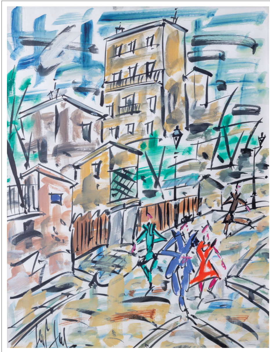
Rue a Montmartre gouache on Paper 24 13/16 x 19 1/4 in. FG© 137955