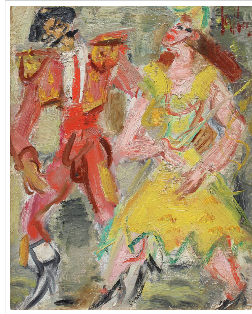
(left) Le Picador oil on canvas 16 1/8 x 9 7/16 in. FG© 136383