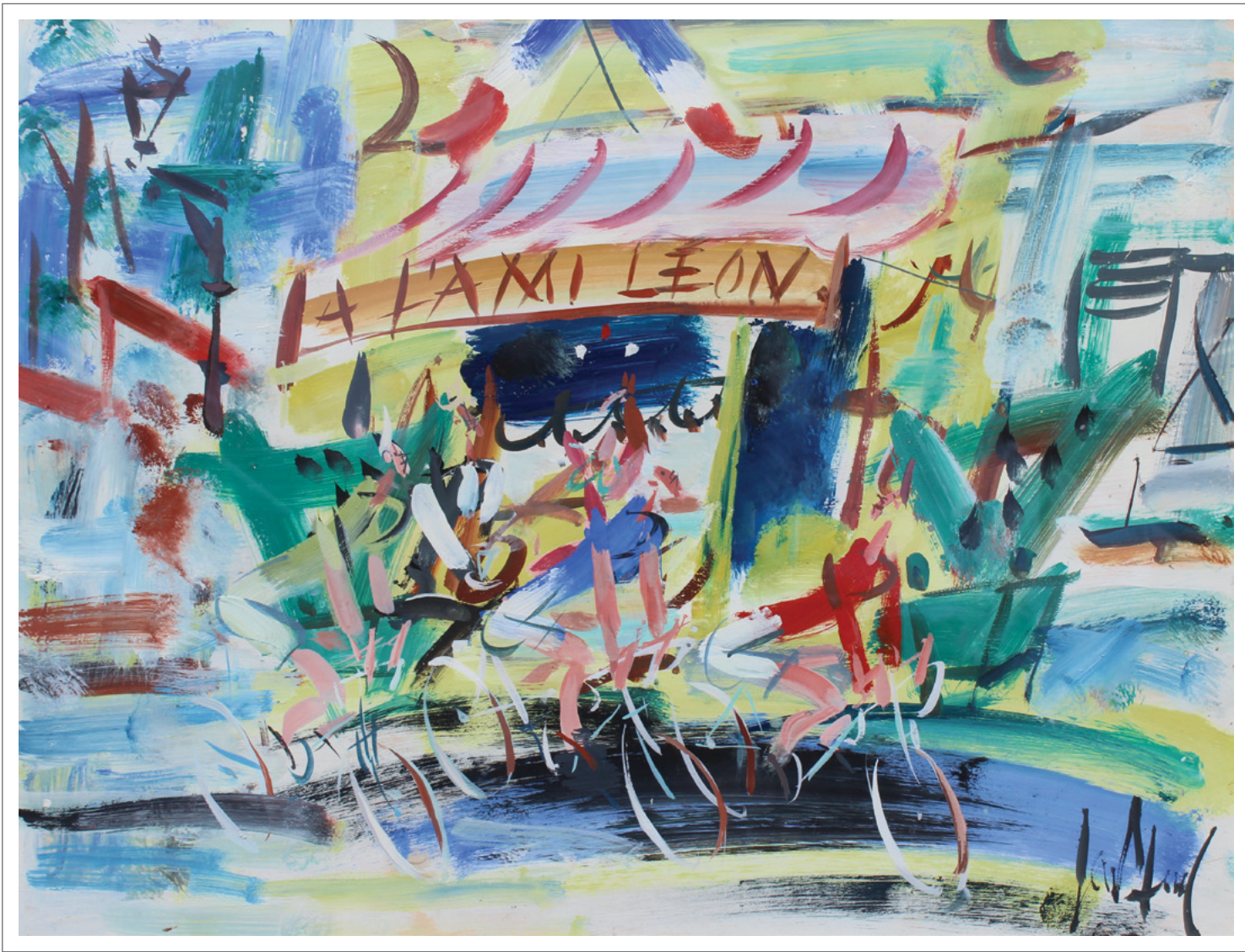
La Course Cycliste | gouache on paper | 18 7/8 x 25 in. | FG© 136384