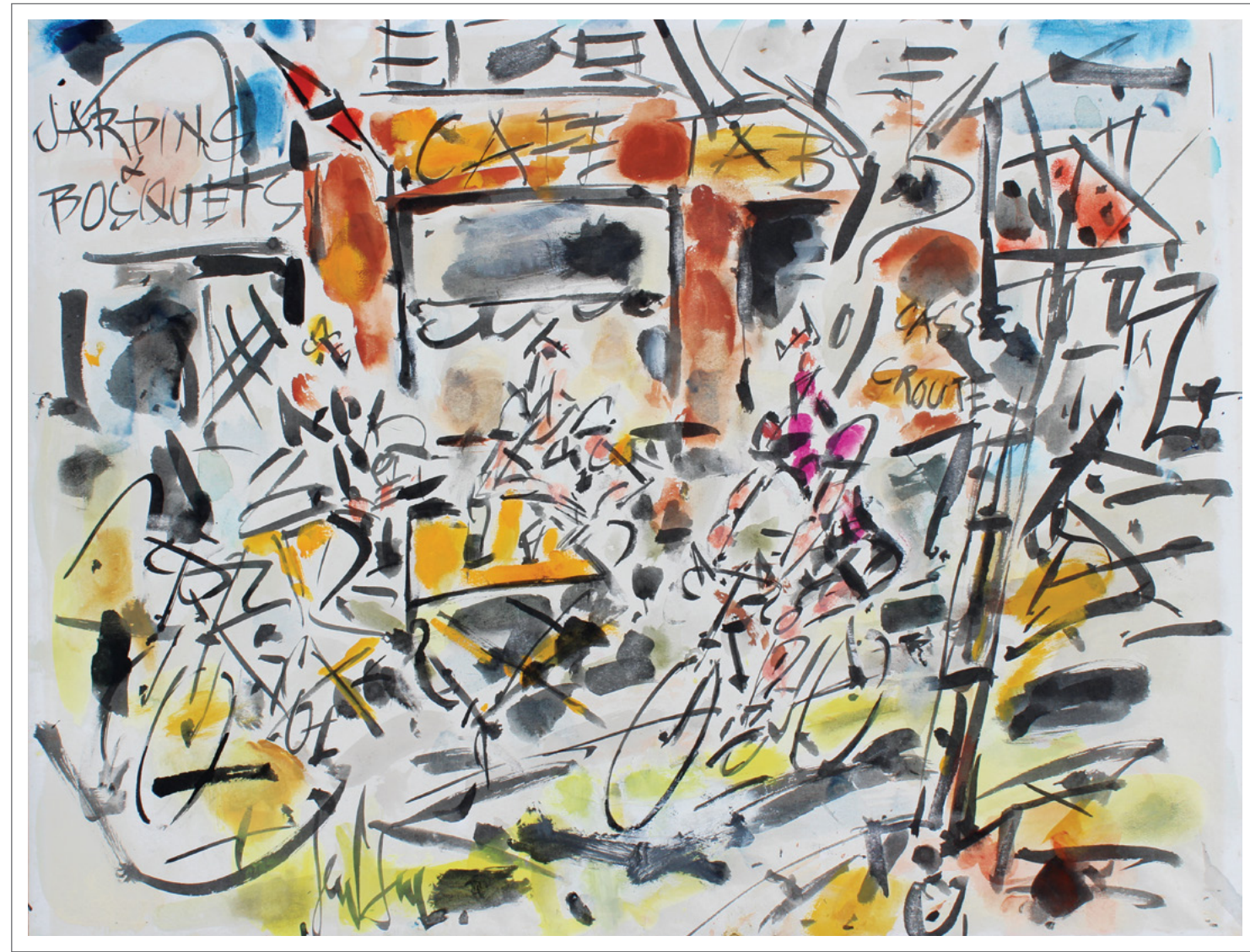
La Course Cycliste | watercolor and gouache on paper | 18 3/4 x 24 1/4 in. | FG© 140119