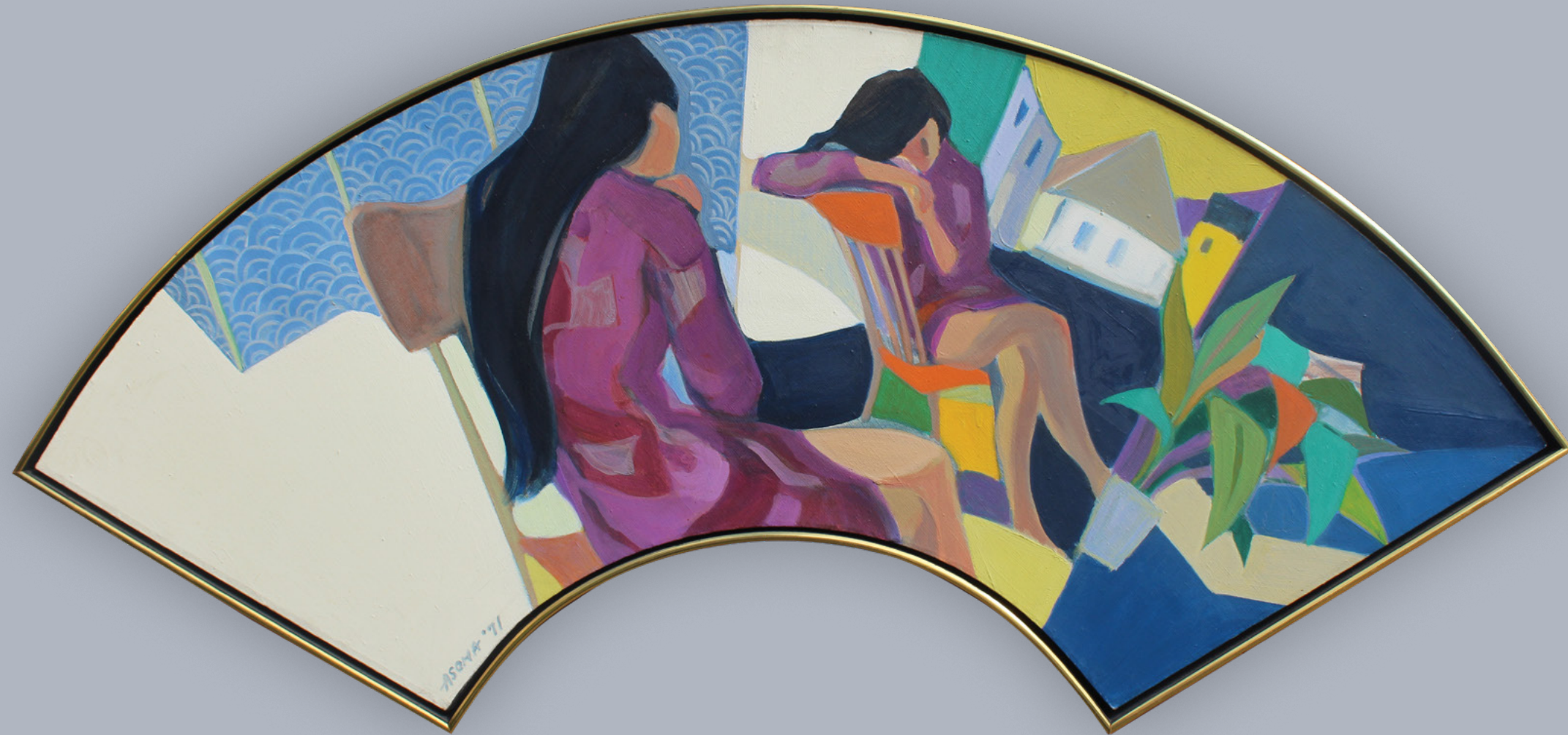
Purple Reflections (lunette), 1971 oil on canvas 22 x 47 in. FG© 139952