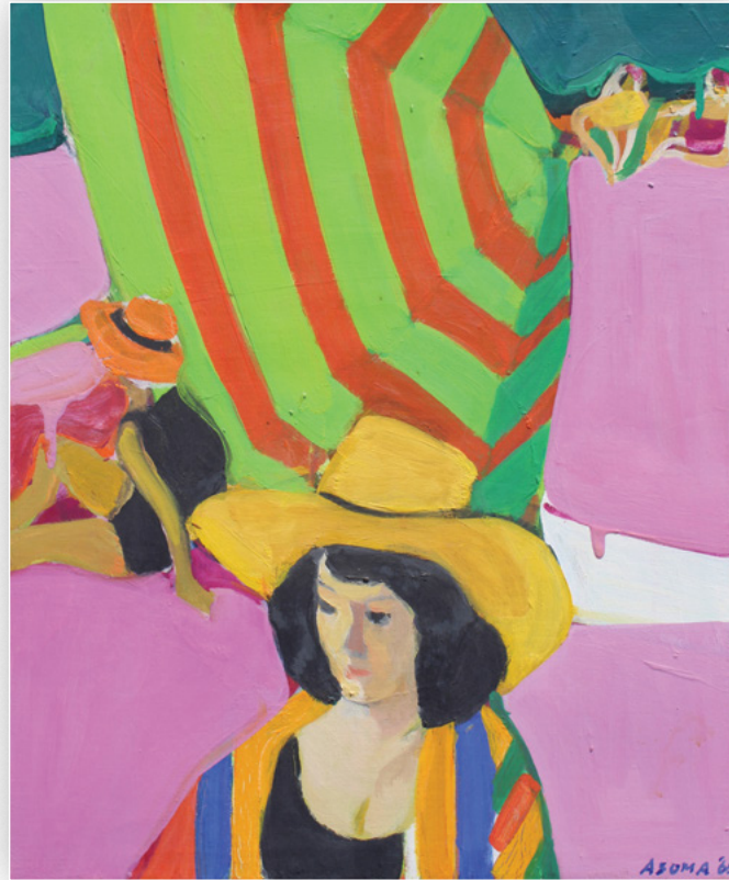
Hisayo on Beach, 1965 oil on canvas 21 1/2 x 17 1/4 in. FG© 139666