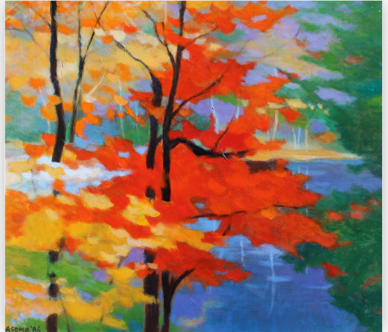
Glory of Fall, 1986 | oil on canvas | 18 x 21 1/4 in. | FG© 140227