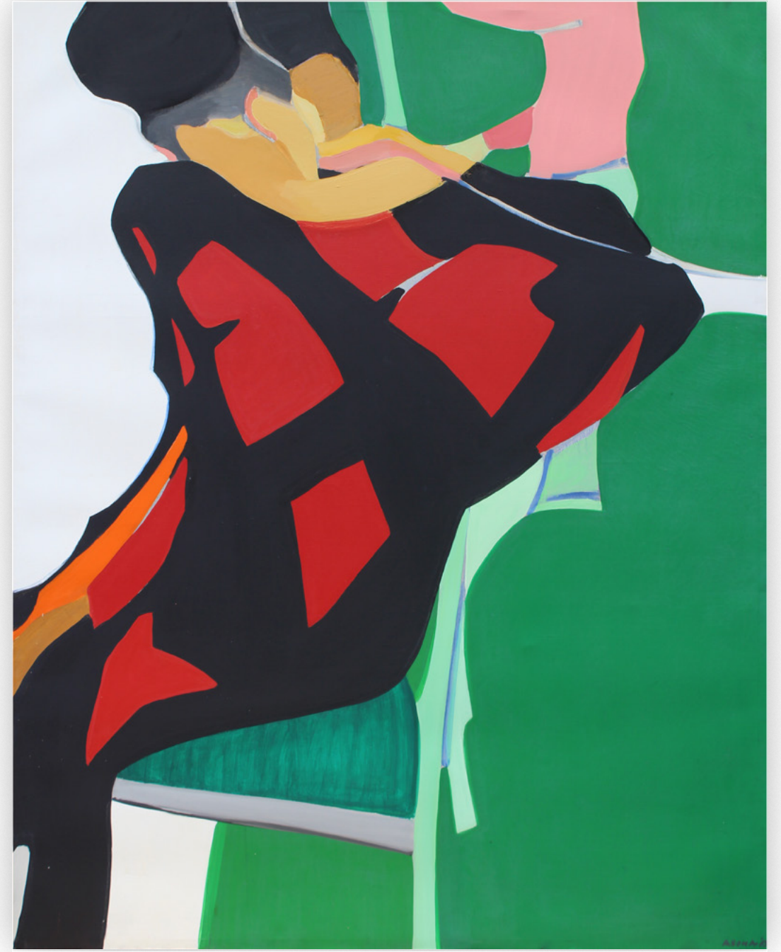
Woman Seated , 1965 | oil on canvas | 65 1/4 x 50 1/8 in. | FG© 139659