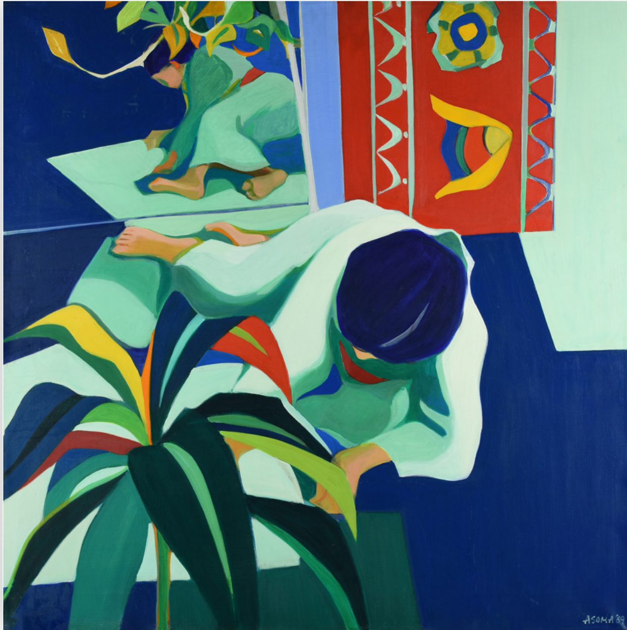
Woman in repose, 1969 | oil on canvas | 41 x 41 in.