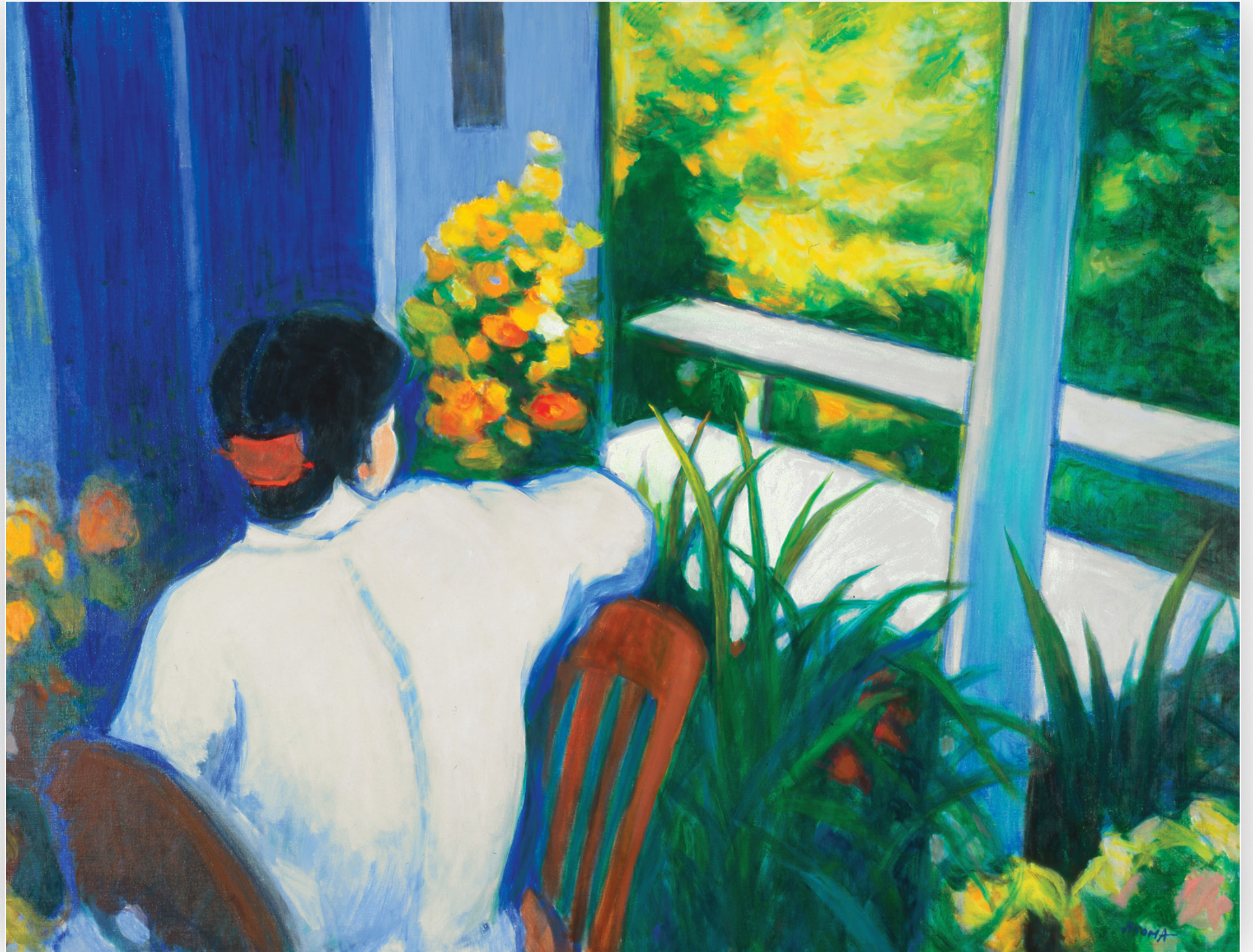
Woman with Flower , 2007 oil on canvas 51 3/16 x 38 3/16 in. FG© 131290