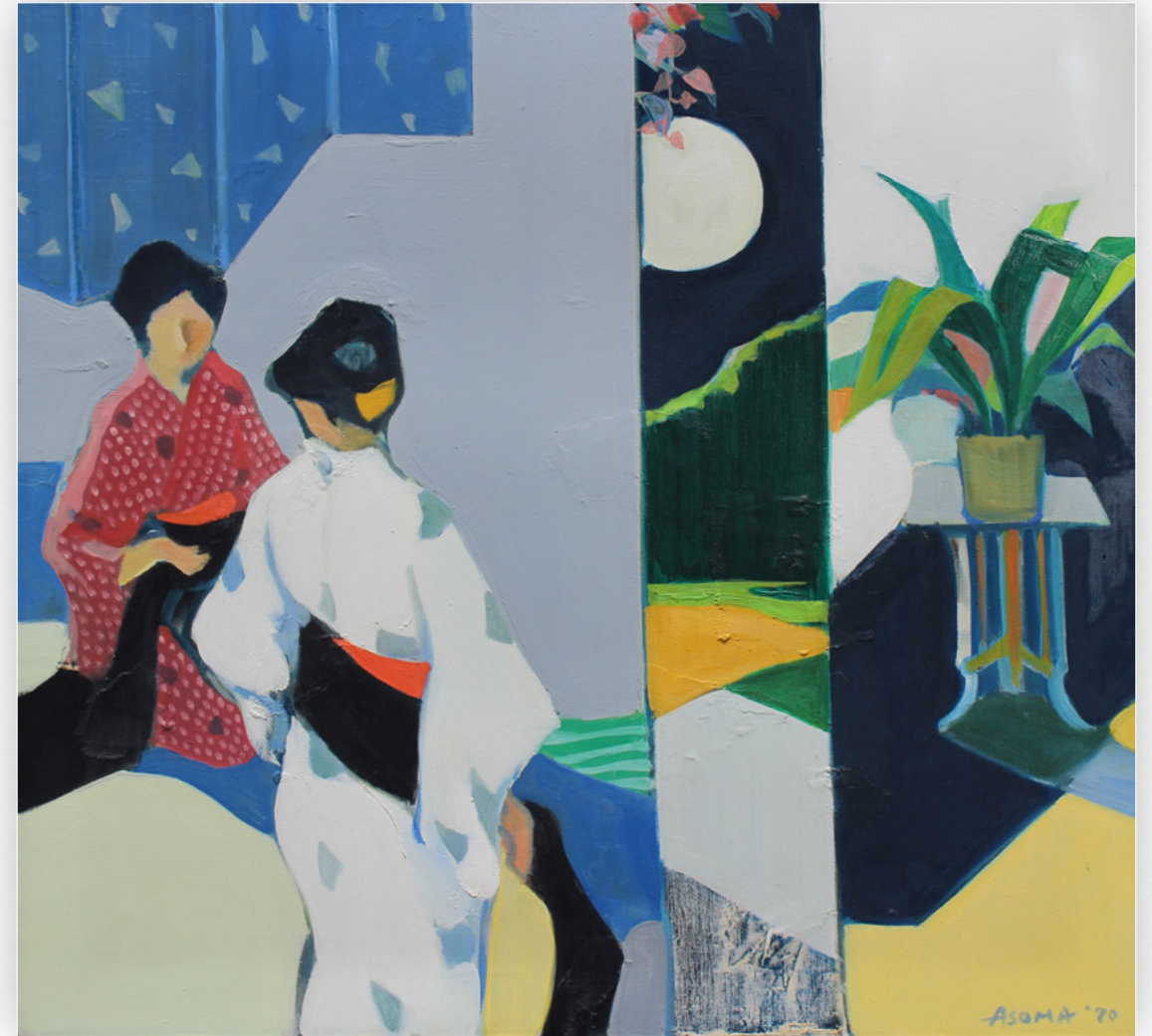
Women and the Moon , 1970 | oil on canvas | 24 1/4 x 25 7/8 in. | FG© 139664