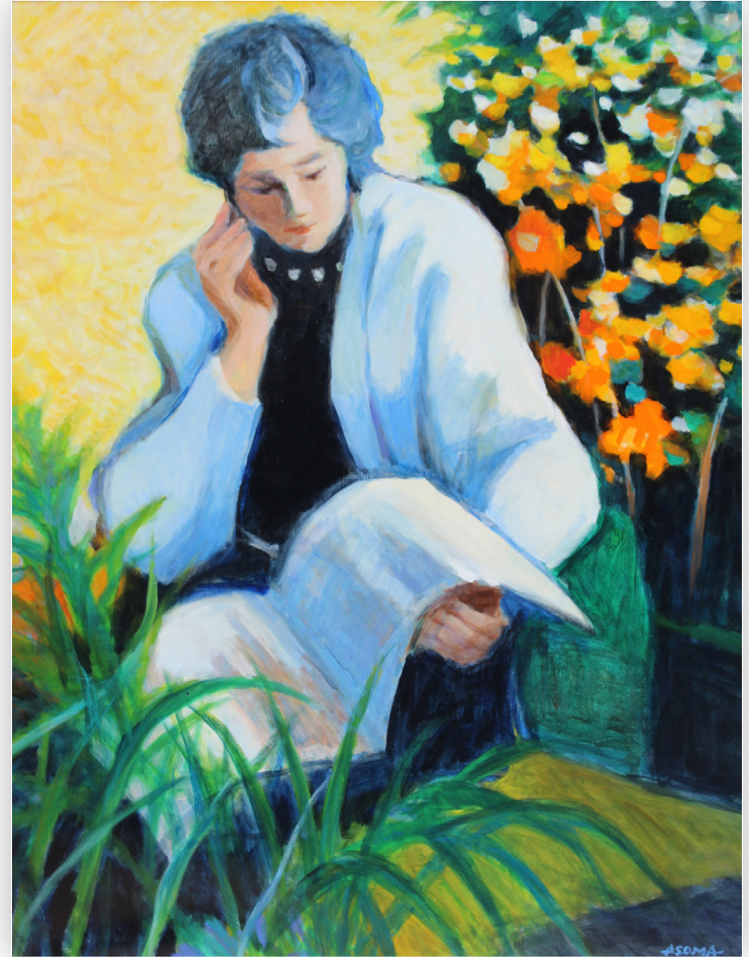
One Summer Day, 2007 | oil on canvas | 45 11/16 x 35 1/16 in. | FG© 131295