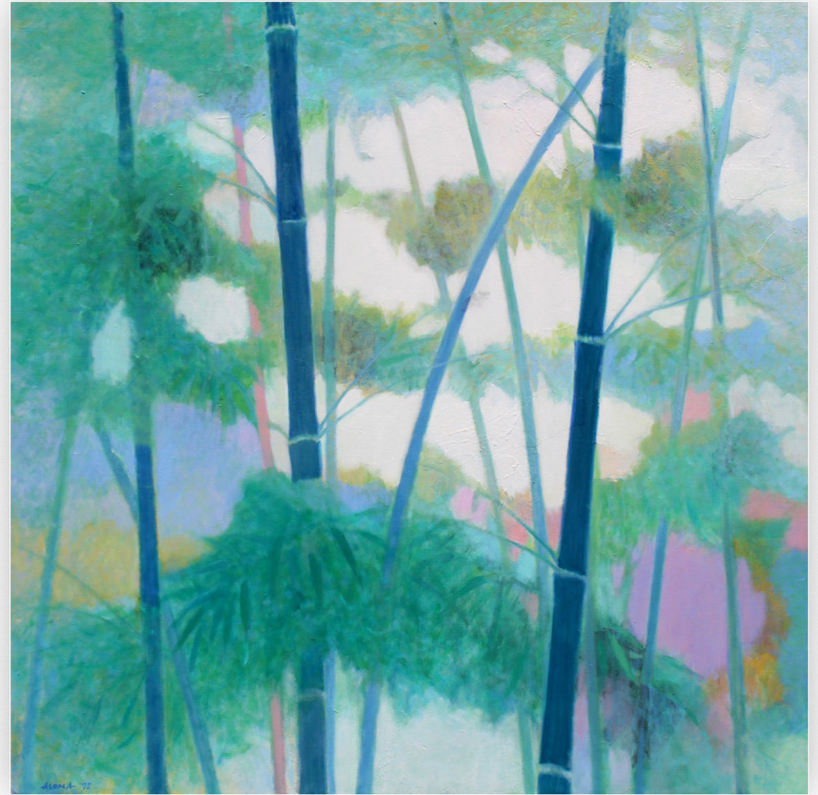
The Bamboo Grove , 1975 | oil on canvas | 50 1/8 x 50 1/8 in. | FG© 139669