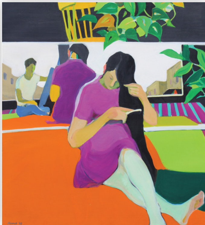
Black Hair, 1968 oil on canvas 35 3/16 x 32 in. FG© 139665