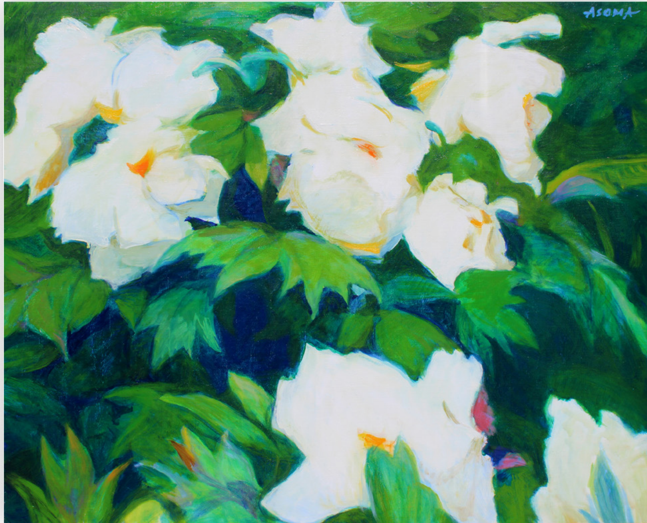
White Peonies , 2007 | oil on canvas | 36 1/4 x 28 3/4 in. | FG© 131304