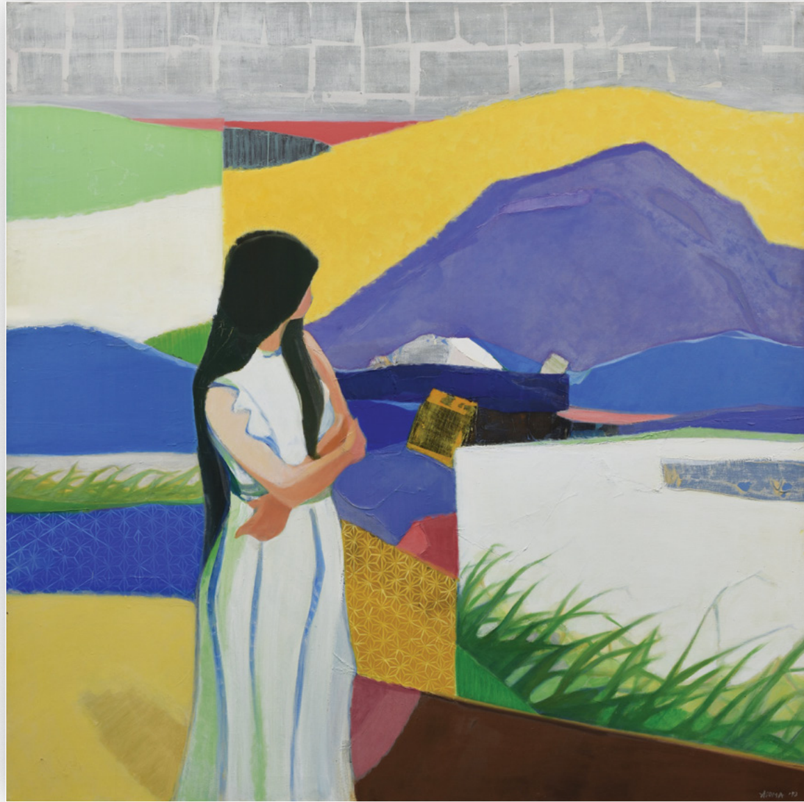
Autumn , 1973 | oil on canvas | 66 x 66 in. | FG© 140025