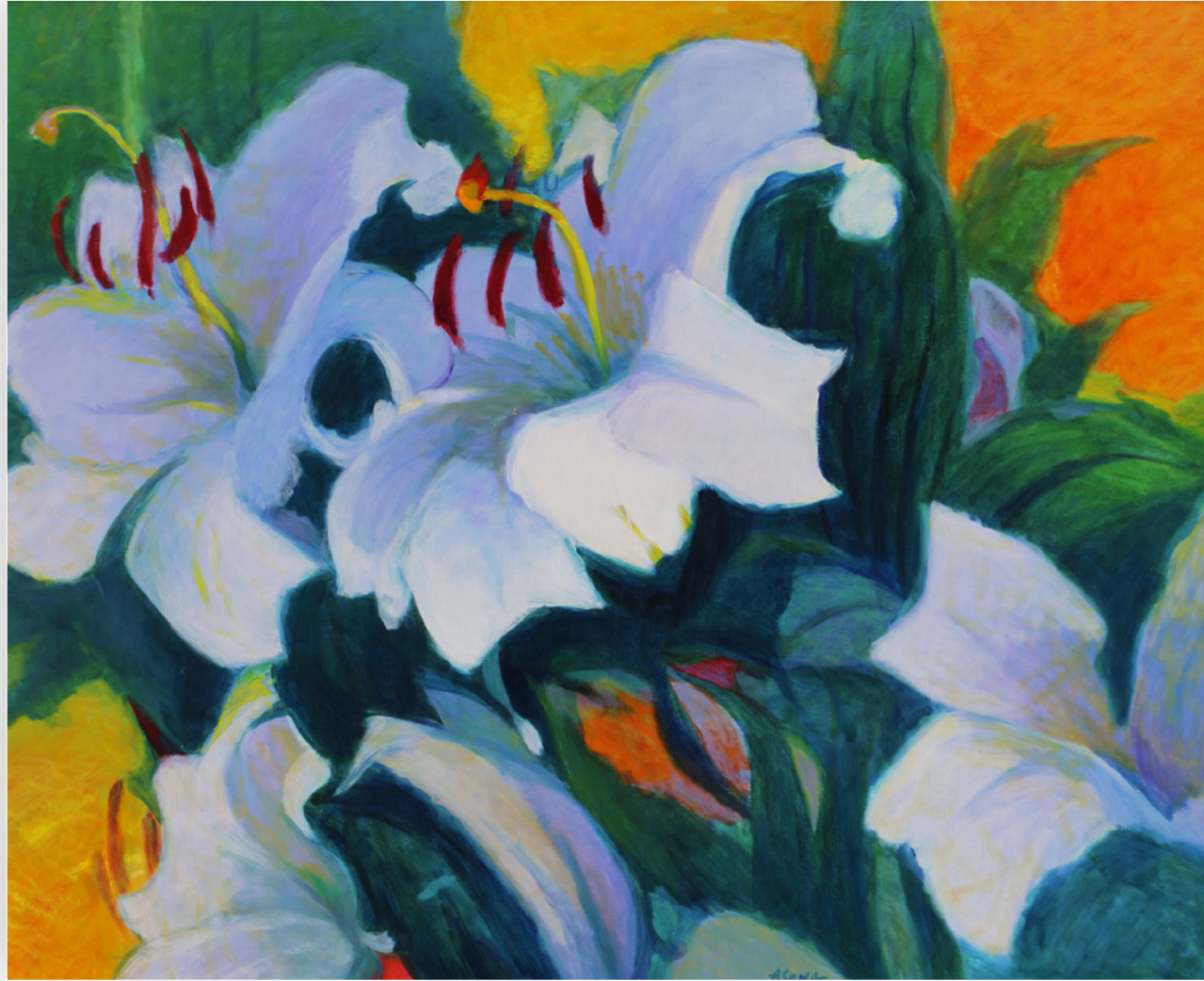
Lily Flower, 2007 | oil on canvas | 39 3/8 x 31 7/8 in. | FG© 131299