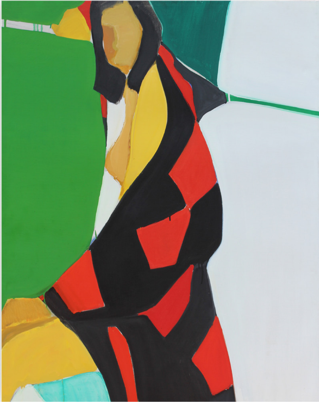
(cover) Seated girl with kimono , 1965 | oil on canvas | 52 x 41 1/2 in. | FG© 138610