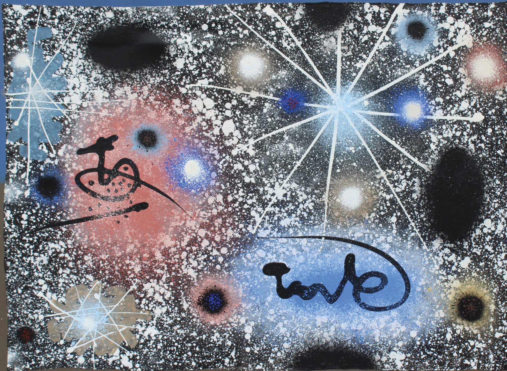
Honey Bee Space , 1989 acrylic on canvas mounted on canvas 44 1/8 x 58 in. FG© 140197