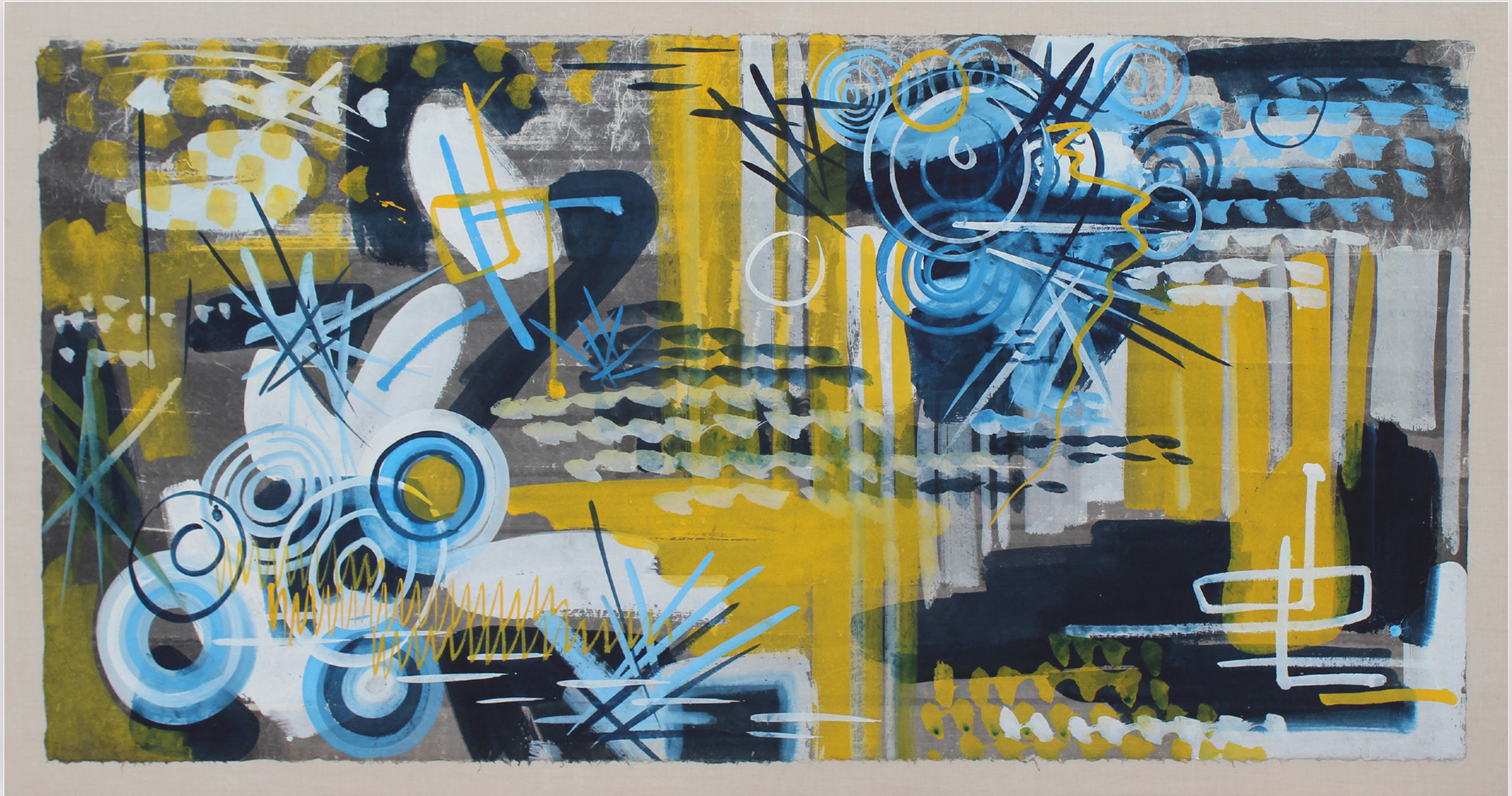
Untitled (1013) , c.1950 | casein on mulberry paper mounted on canvas | 36 x 71 in. | FG© 140183