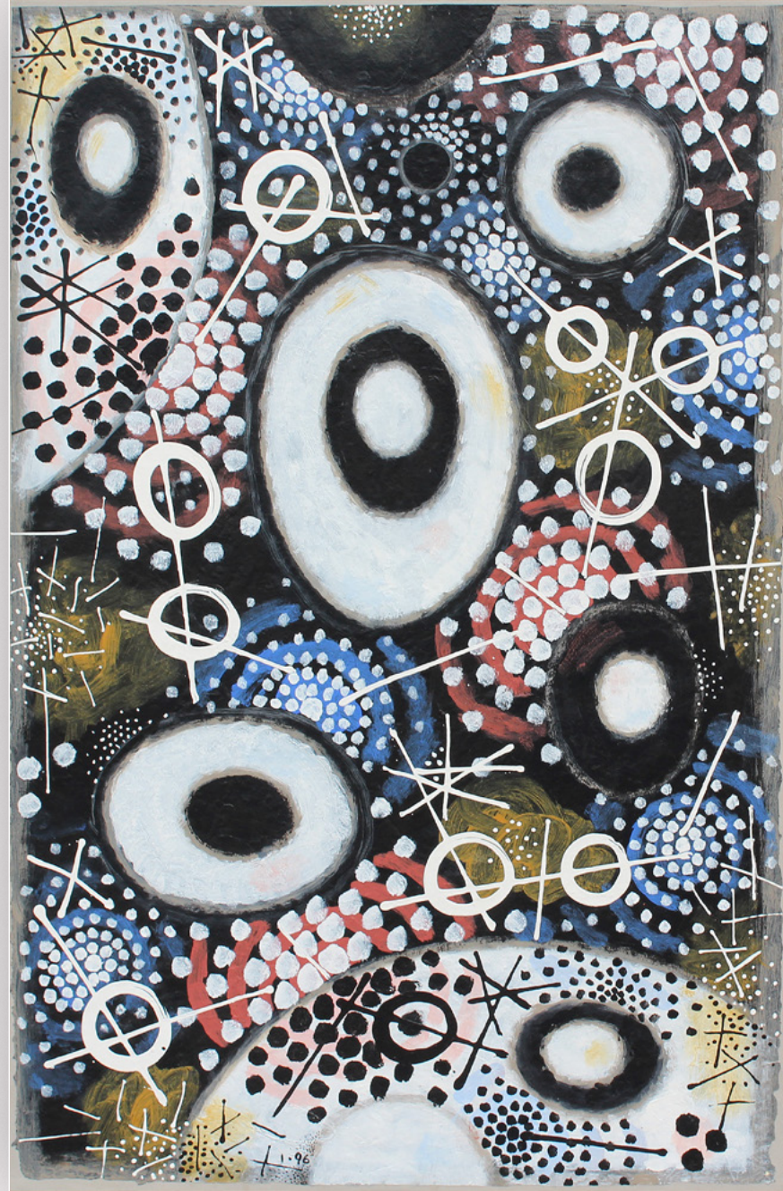
Eco Echo , 1996 | acrylic on paper mounted on canvas 56 1/2 x 36 1/2 in. | FG© 140188