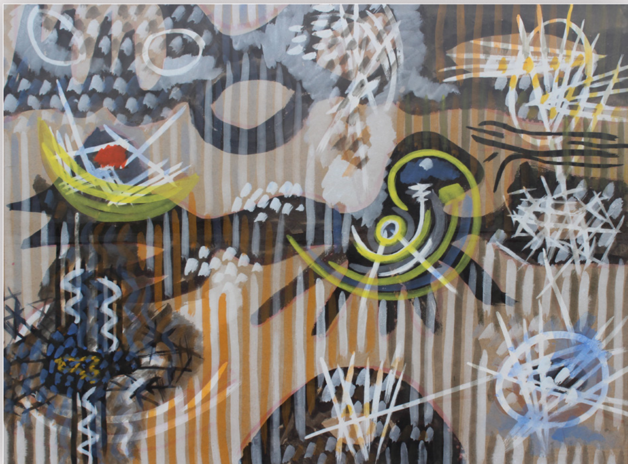
Moon Growers , 1951 | gouache on paper | 18 x 24 3/4 in. | FG© 140200