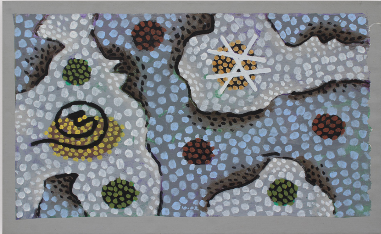
Star and Being , 2002 | acrylic on paper mounted on linen 25 1/2 x 45 1/2 in. | FG© 140194