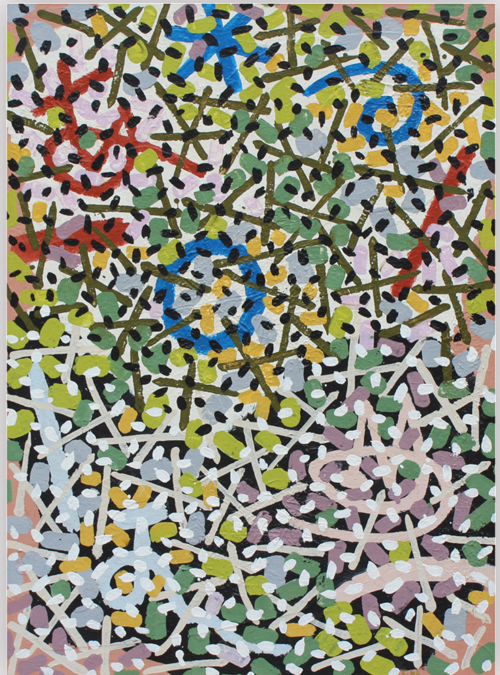
Space In Bloom , 1966 | acrylic on board | 61 1/4 x 43 1/4 in. | FG© 140193