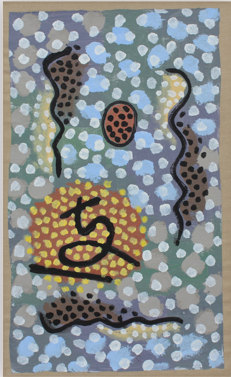
In The Light , 2002 | acrylic mounted on canvas 38 1/4 x 21 7/8 in. | FG© 140199