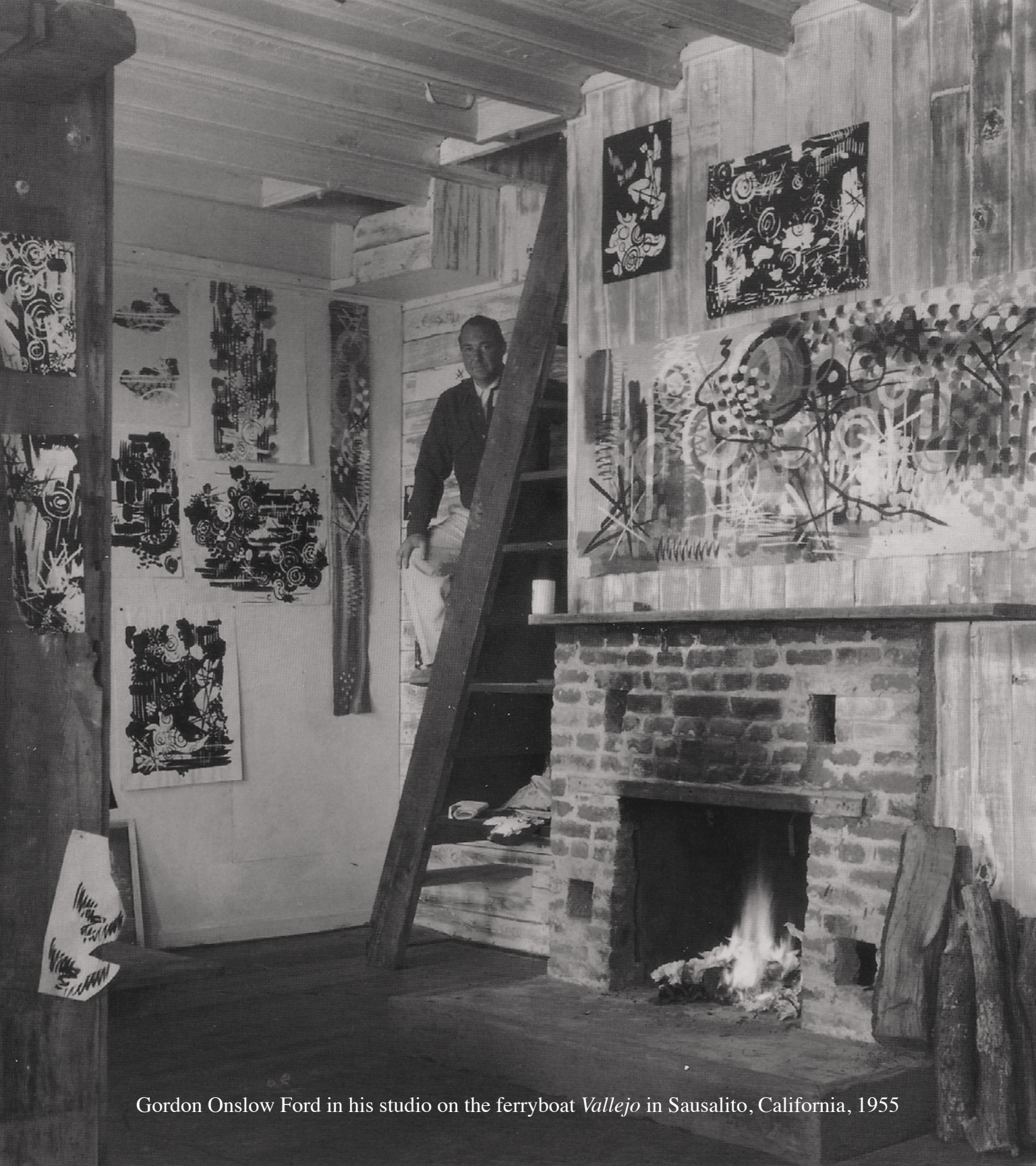
Gordon Onslow Ford in his studio on the ferryboat Vallejo in Sausalito, California, 1955

British-born American painter Gordon Onslow Ford (1912-2003) was an important bridge between the Parisian Surrealist and Abstract Expressionist movements, exploring interests in spontaneous creation and metaphysical ideas like the collective unconscious.