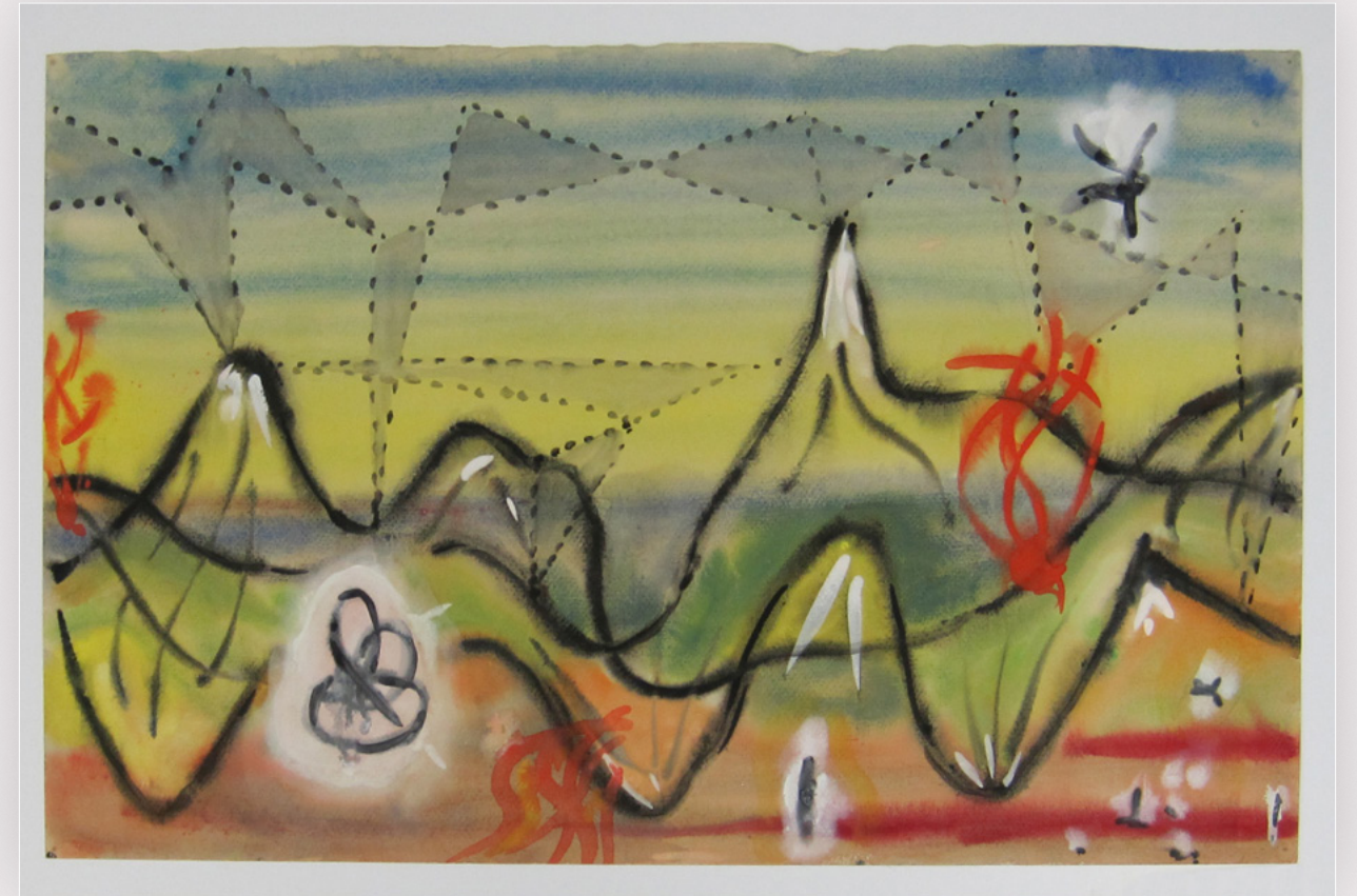
Untitled (1939-090) , 1939 | watercolor on paper | 12 1/2 x 19 1/2 in. | FG© 207000

It is a function of art to bring wonder into the world.