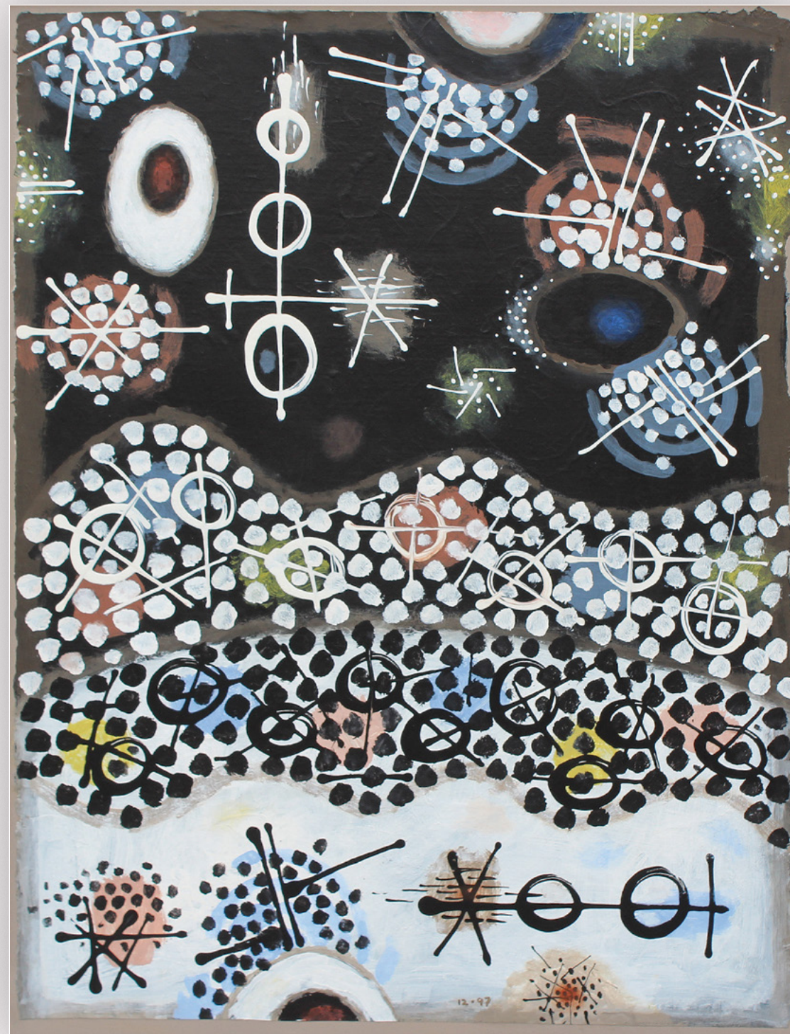
Heaven is Earth , 1997 acrylic on paper mounted on canvas 50 x 37 1/2 in. FG© 140196