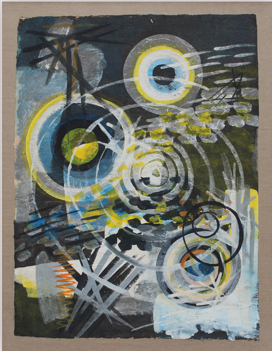
Swarm of Hearts , c.1950 | casein on mulberry paper mounted on canvas 38 5/8 x 28 1/4 in. | FG© 140195