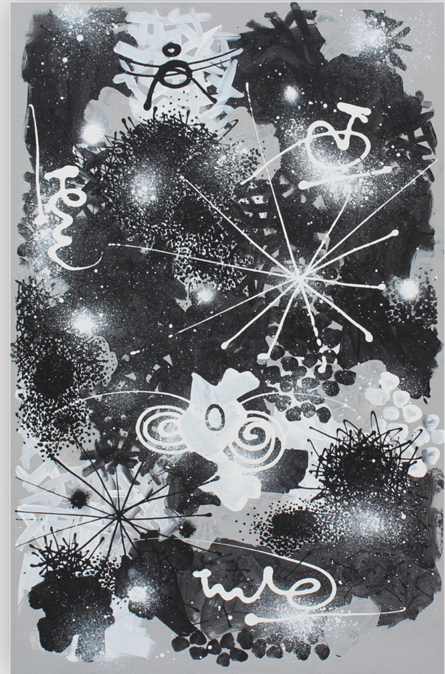
Cultivate , 1988 | acrylic on canvas | 63 7/8 x 40 1/4 in. | FG© 140187