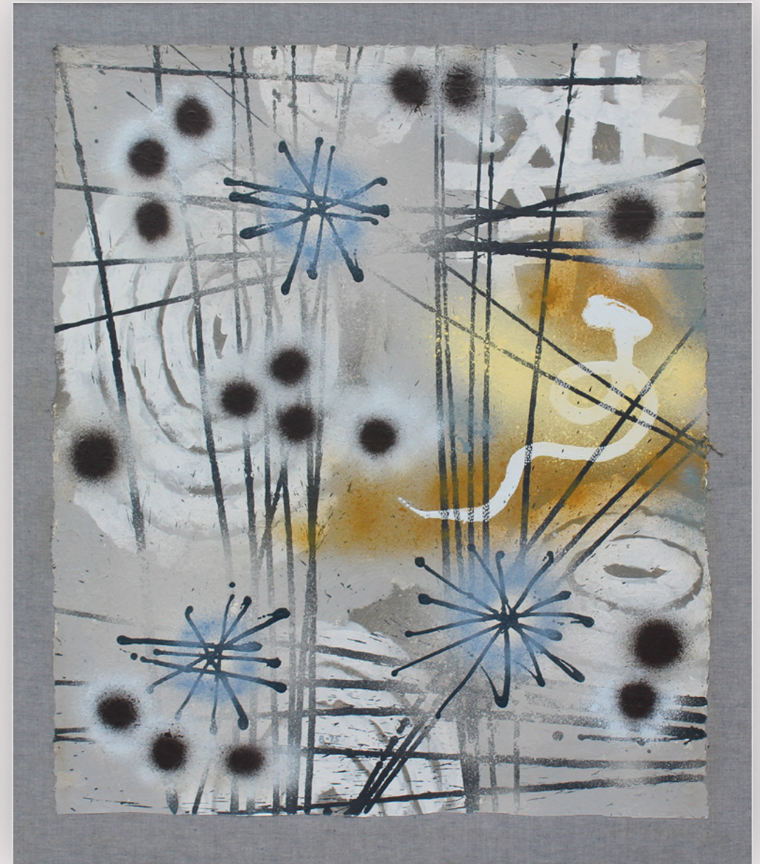
Voyager in Space , 1975 | acrylic on paper mounted on canvas 46 x 39 3/4 in. | FG© 140185