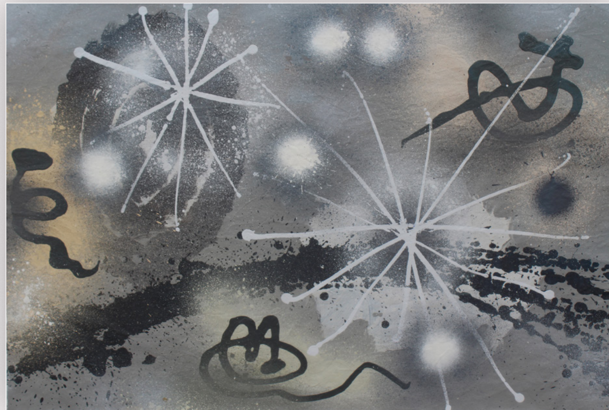
Voyagers , 1976 | acrylic on mulberry paper | 24 1/2 x 36 in. | FG© 140202