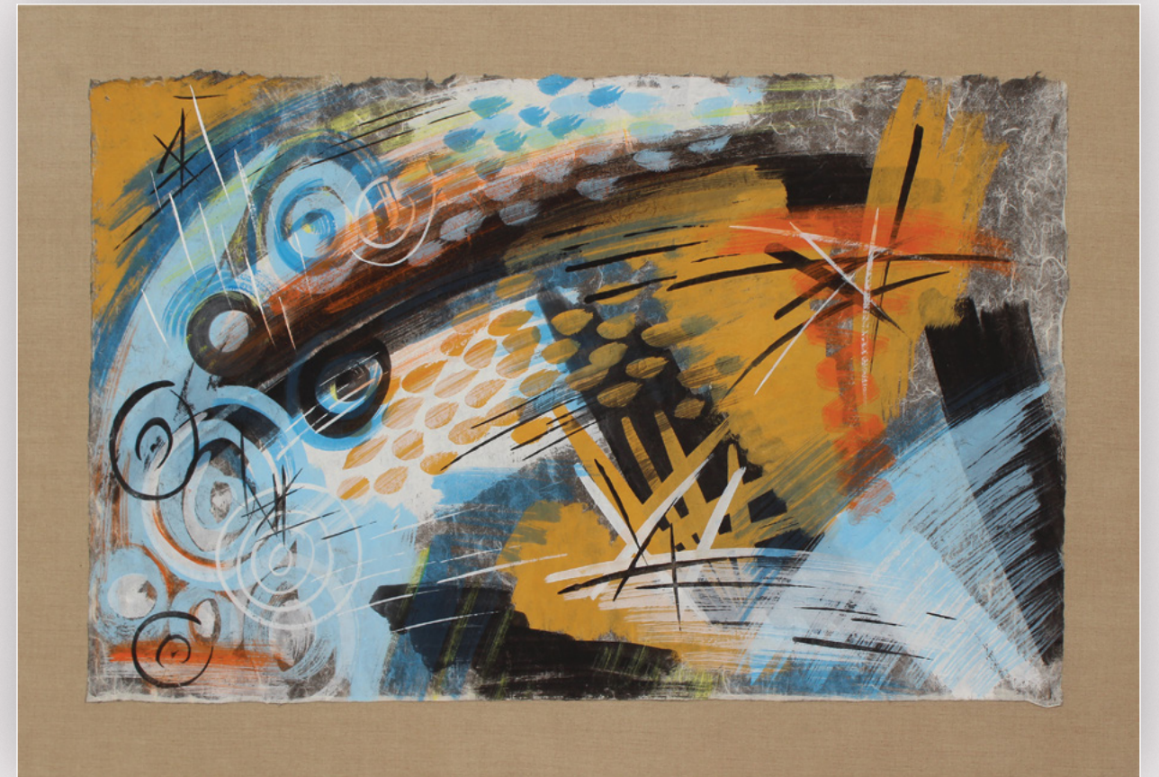
Grass Leap , 1955 | casein on mulberry paper mounted canvas 24 3/4 x 39 7/8 in. | FG© 140190