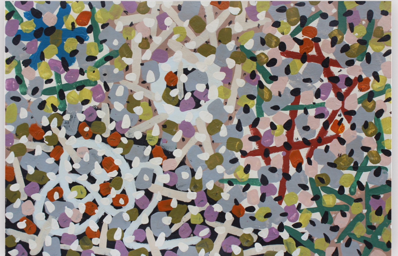
In Inlanders , 1966 | acrylic on paper mounted on canvas 25 1/2 x 38 1/2 in. | FG© 140198