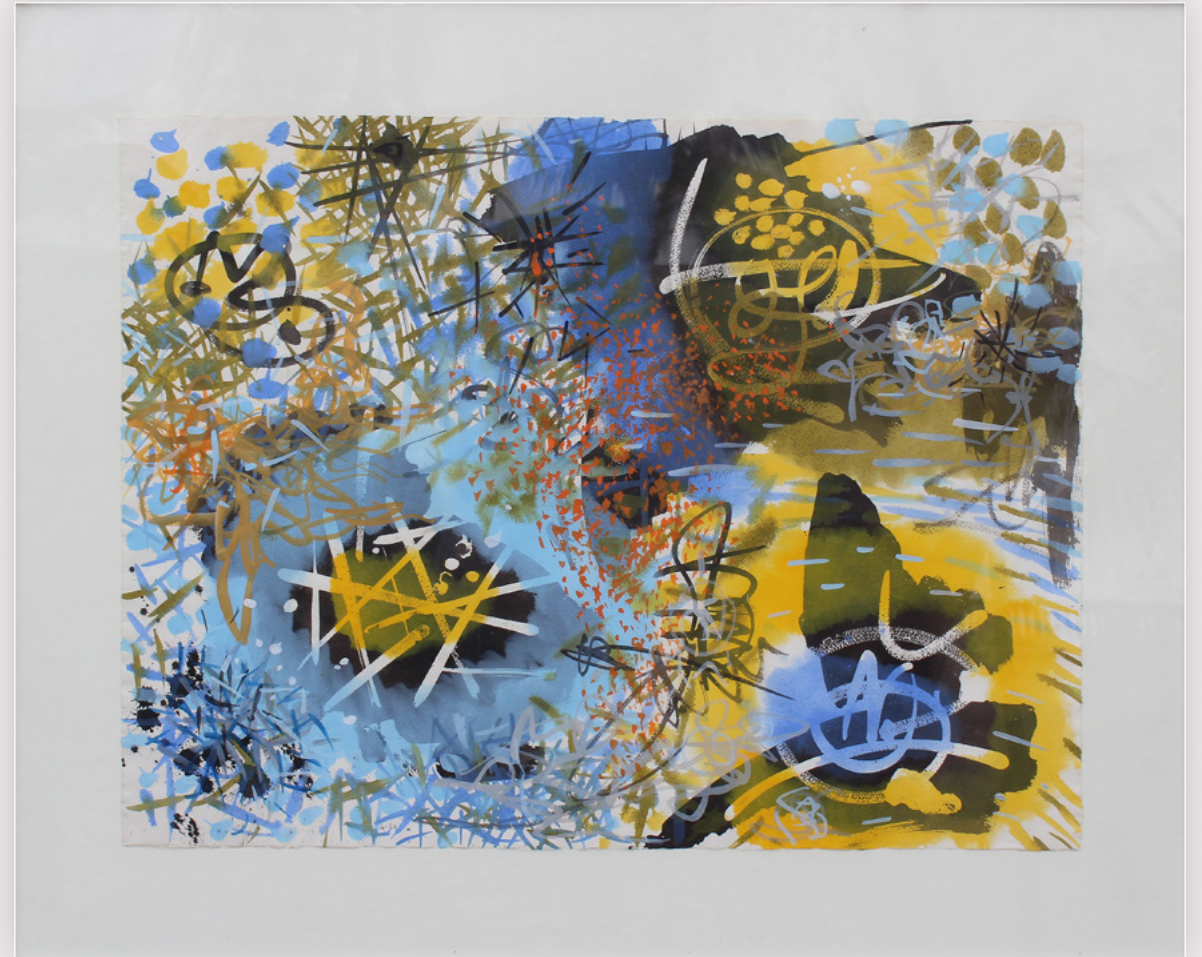
Abstraction in Yellow , 1964 | casein on paper mounted on cardboard 22 1/4 x 30 in. | FG© 140186

I would like my paintings to refresh like deep sleep. Gordon Onslow Ford, Insights , 1991